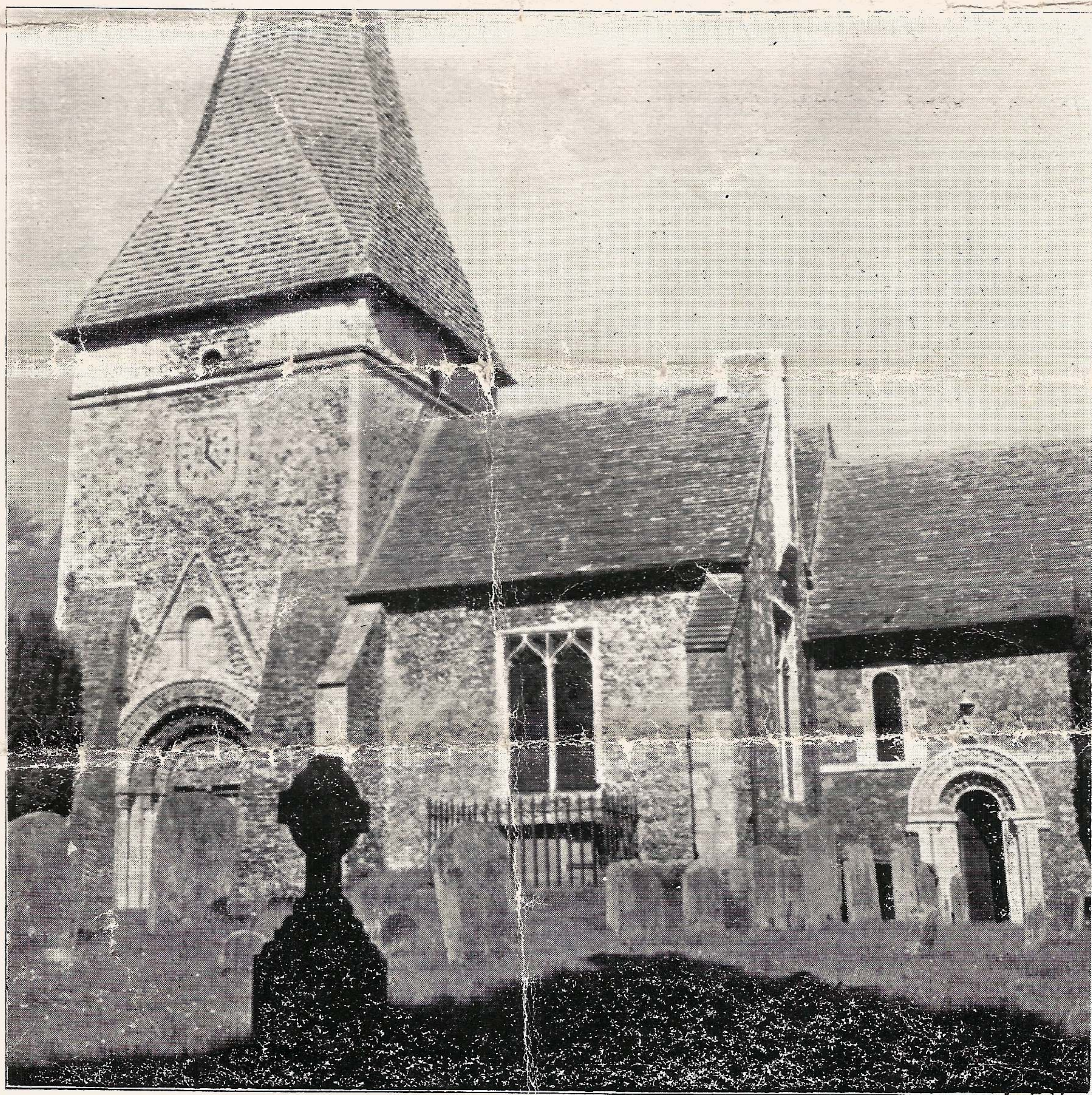
GENERAL VIEW SOUTH