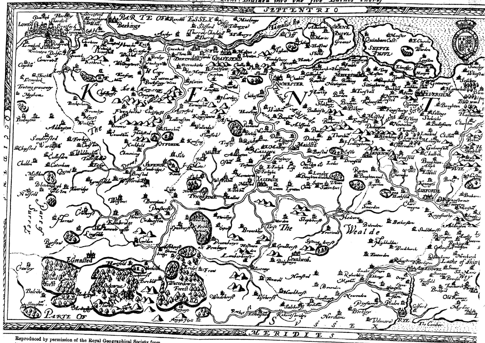
Reproduced by permission of the Royal Geographical Society from its copy of the first issue of the original map. F. G. R. 1908