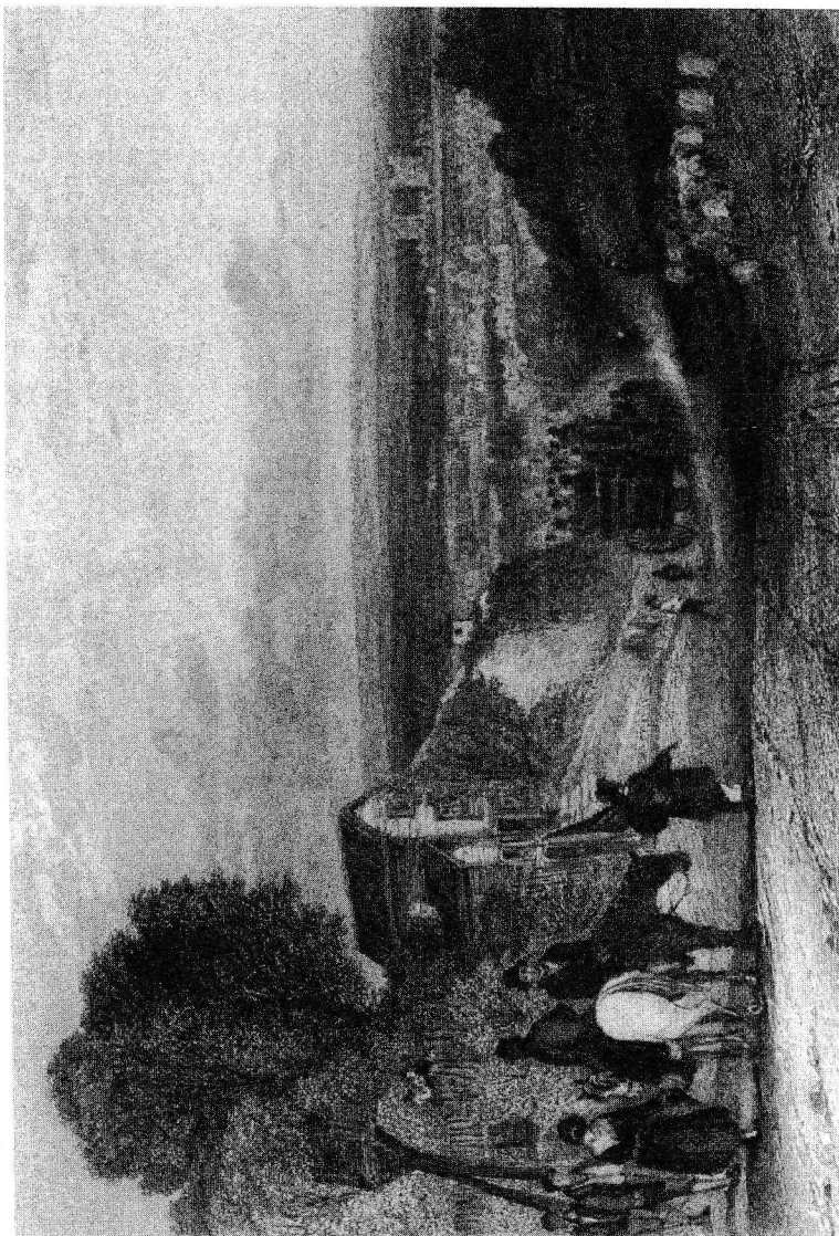
Watling Street. The approach to Rochester from a nineteenth-century print