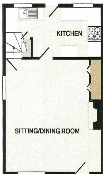
GROUND FLOOR APPROX. FLOOR AREA 310 SQ.FT. (28.8 SQ.M.)

The property is 'bought as seen' and the Agents are unable to comment on the state and condition of any fixtures, fittings and appliances etc.