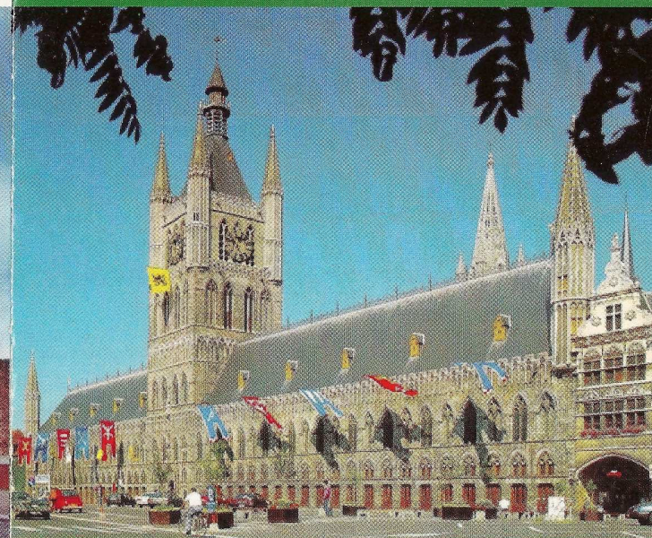
Front cover: Cloth Hall, Ypres