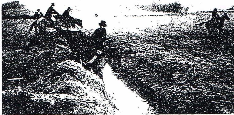
Three Perfectly Schooled Irish Hunters.

To me there never has been such a combination of happiness and exaltation as when I have been on the back of a blood horse and he is holding his own with the best. There is that tense feeling which comes over you as you mount at the meet; there is that keen desire to be away at the first whimper; the great feeling of pleasure that creeps over the experienced horse and hunting man when they set in behind the pack on a good scenting day; and above all that eager thrill which throbs from head to heel when the jumps follow each other in rapid succession. * * * The older we grow, the more we drop out of all competition save those of the brain. Many can look back and think of the pleasure they had when they knocked out a home run, carried the ball between the posts for a touchdown, or pulled off the vintage set of a tennis match; but hunting alone gives the older man the opportunity of still indulging in that splendid competition of mind and body which makes him young again. With hounds screaming in front and a gallant horse under you, no jump seems too big, and holding your hunter firmly together you scan the first-fighters with as keen an eye as you scanned the starters in any steeplechase years before! And so say all of us!