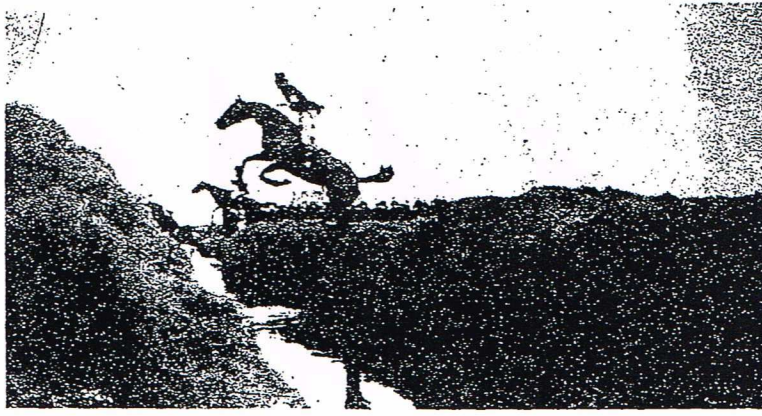
The Black Ditch, Limerick.

These things need not be exaggerated and I do not wish to exaggerate