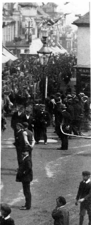
... peaked forage caps.

... three cornets, saxophone, seven ... drum, bass drum and boy cym-