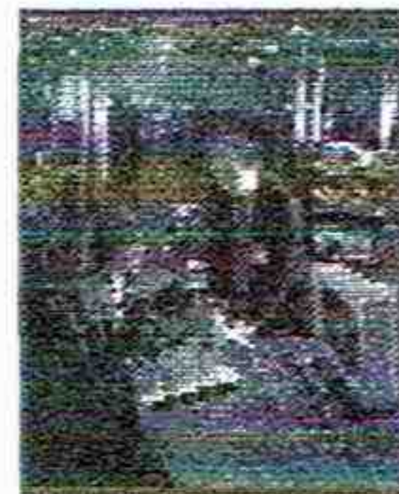
(41K image file) NMR009

However, please note that searches of our computerised database of aerial photographs need to be requested well in advance of your visit. For more information please see our public services section .