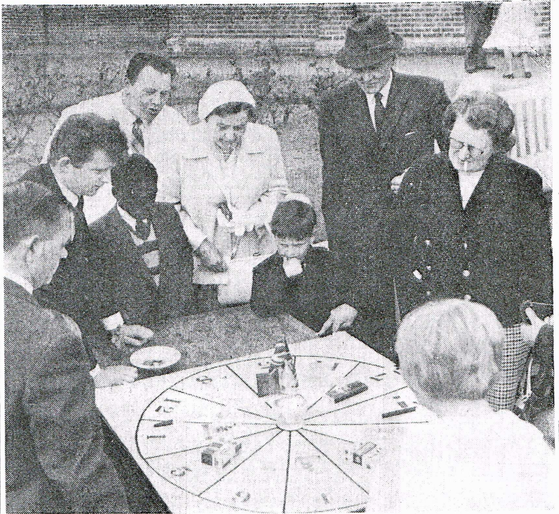
Visitors to The Close open day trying their luck on the wheel of fortune.