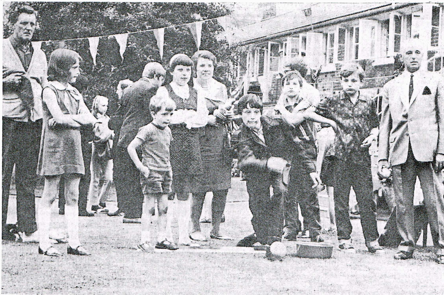
There was keen support from young and old for the bowling at The Close, Bridge, barbecue and fete on Saturday.