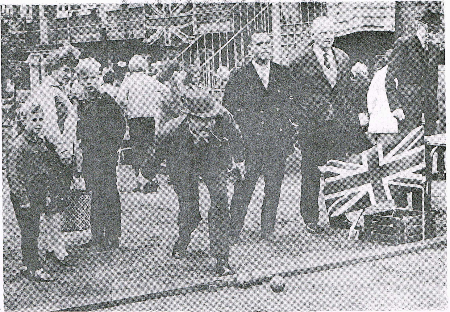
Grim determination during the bowling competition at Bridge fete on Saturday, organised by the Hospital League of Friends.