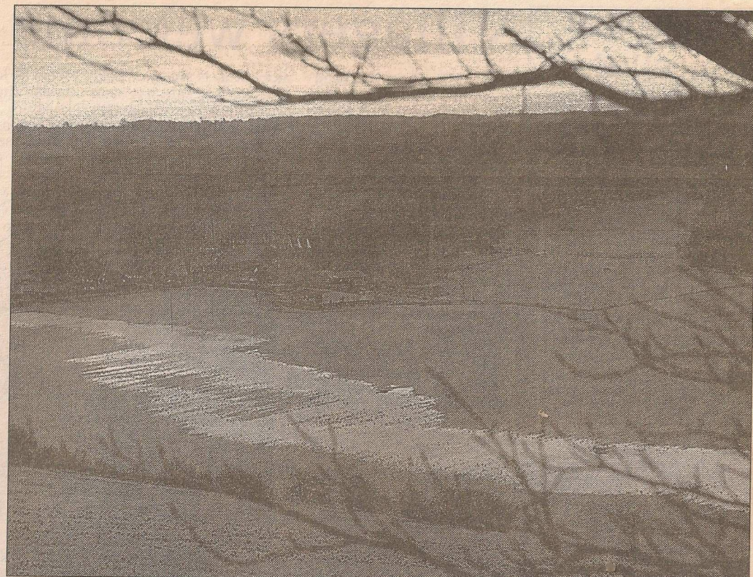
RIVER VALLEY: For the first time in memory the Petham Nailbourne flows through the fields near Kenfield 5/6560E/01