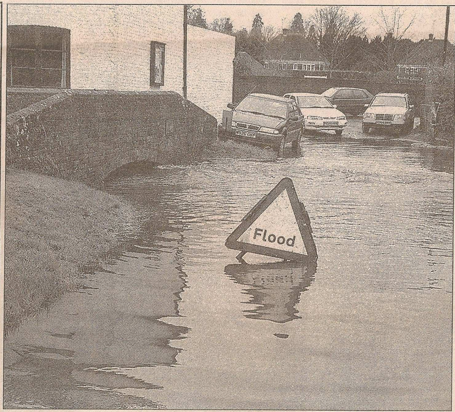
WARNING SIGN: The river flowing through Patrixbourne

Engineers are also considering the permanent provision of an electric pump in Frog Lane, but it will require a stronger electricity supply than is presently available. Seaboard is said to be investigating.