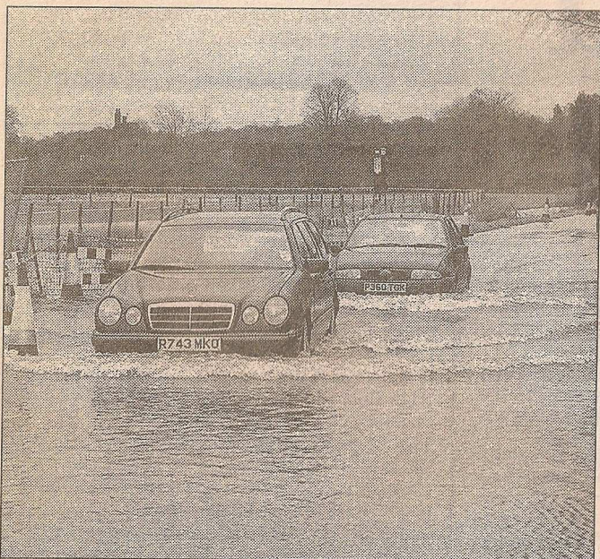
AMPHIBIAN ATTEMPT: The road at the Black Robin, Kingston, under water 9A/6524E/01