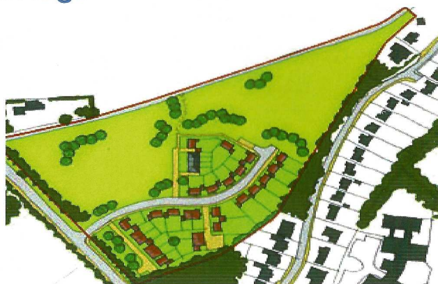
The area proposed between the High Street and Conyngham Lane

The Recreation Ground is an essential facility for the health and enjoyment of the village. It provides the children's play area, football pitches, tennis courts and importantly an open space. The Recreation Ground is not owned by the village. It is leased by the Parish Council from Cantley Estates who own most of the land around the village.