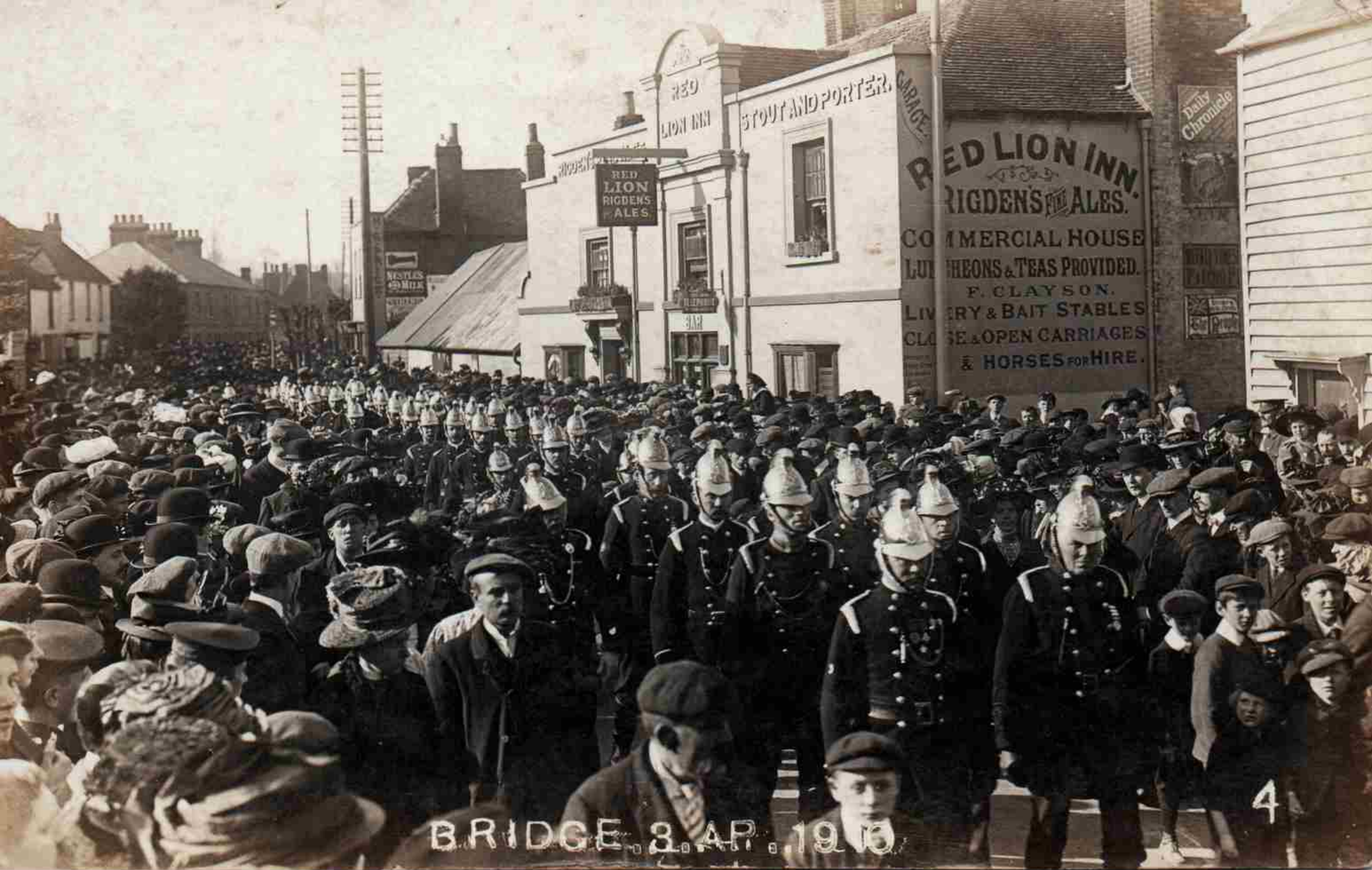
BRIDGE, 3. APR. 1910