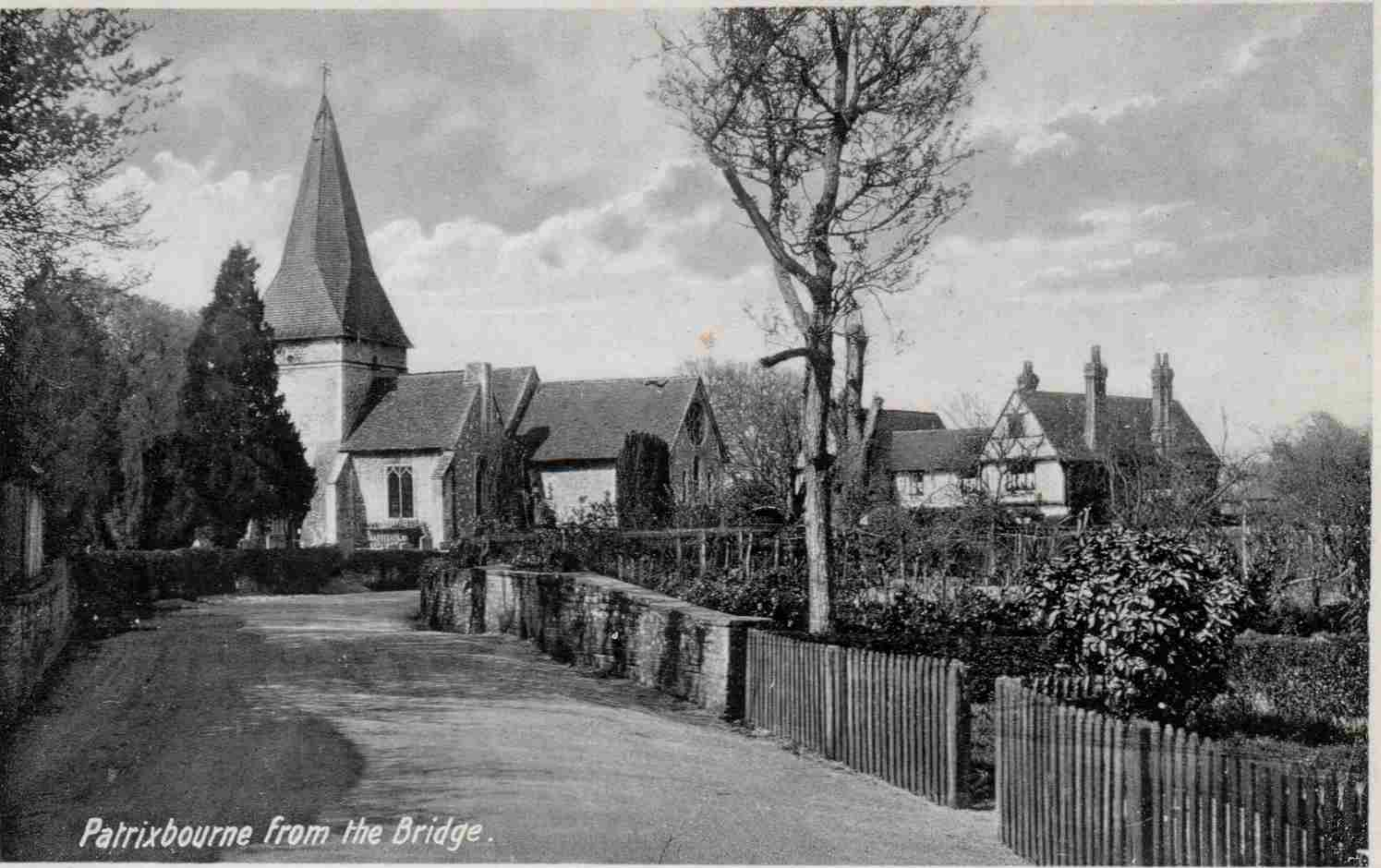
Patrixbourne from the Bridge.