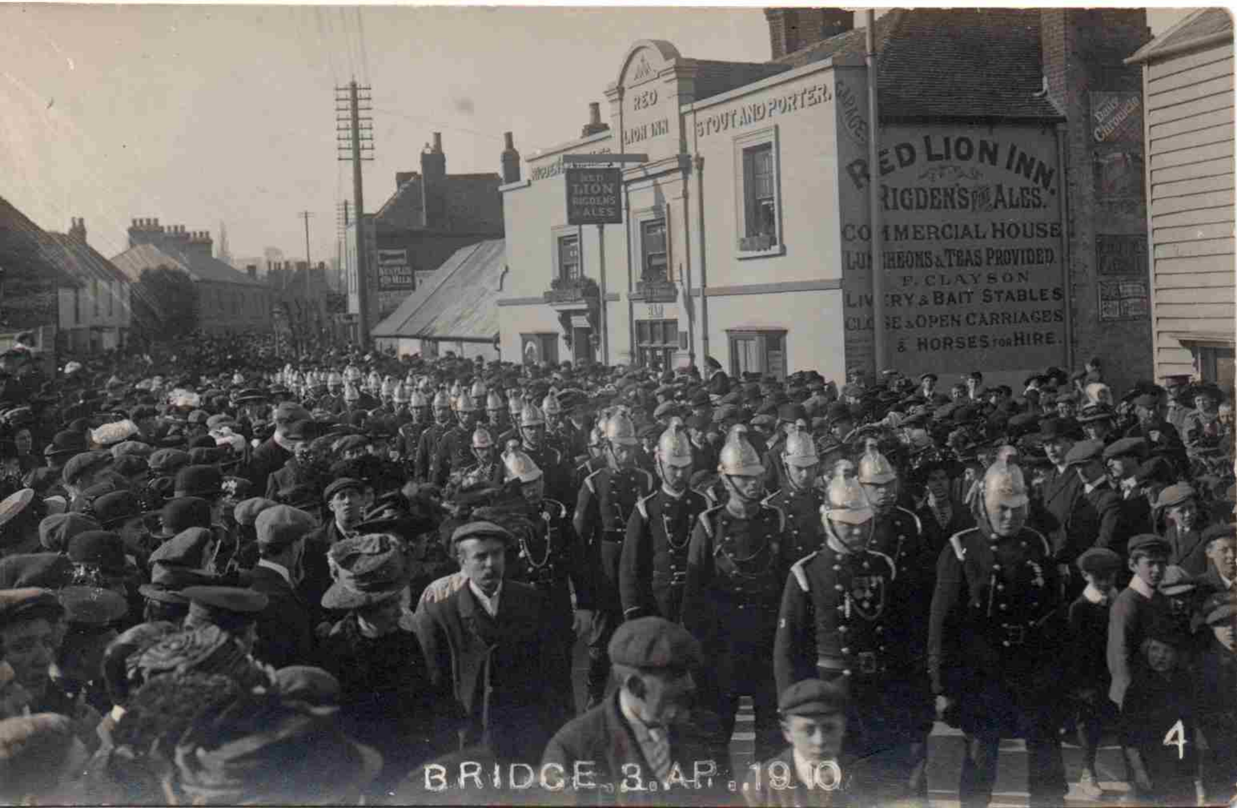
BRIDGE, 3. APR. 1910