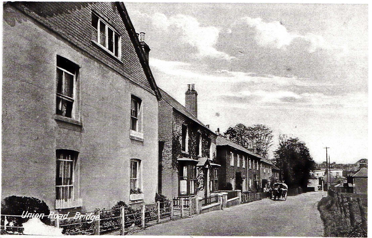
Union Road, Bridge