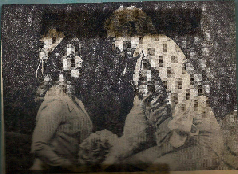
John Stride and Vanessa Redgrave in "The Sinner" one of two one-act plays which opened at the Old Vic Theatre last night.