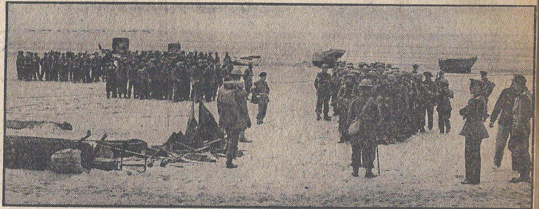
WAITING FOR THE SHIPS. The acted version by the troops on Camber Sands yesterday. BELOW: THE REAL THING. The historic picture of British troops waiting in 1940 on the Dunkirk beaches before the ships appeared.