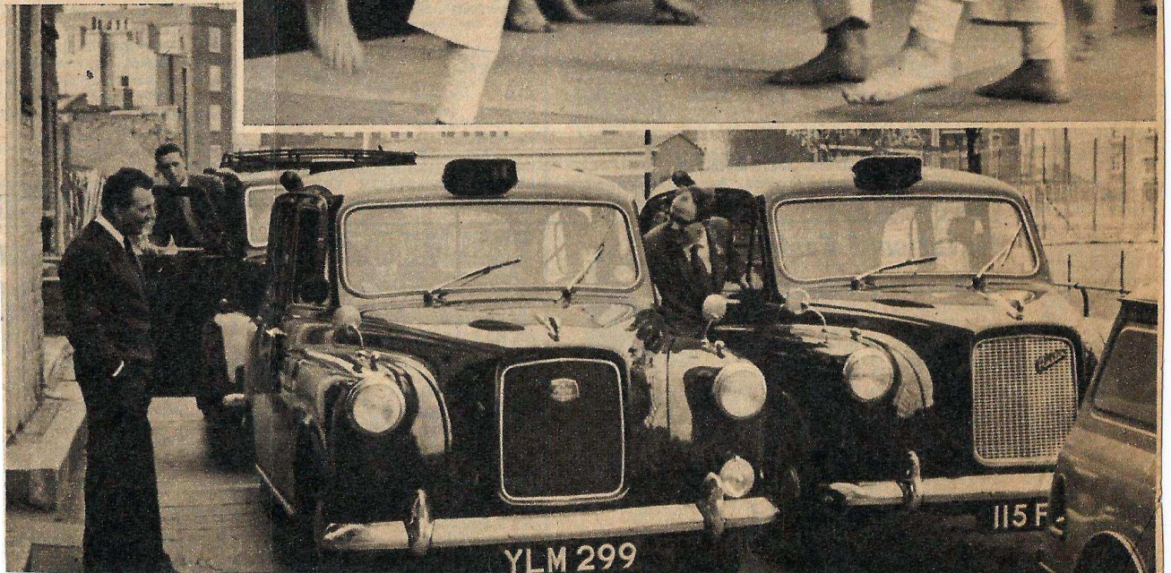
Taxi-drivers find it's handy to have a few judo holds up their sleeves—just in case there's ever a killer in the back seat . . .