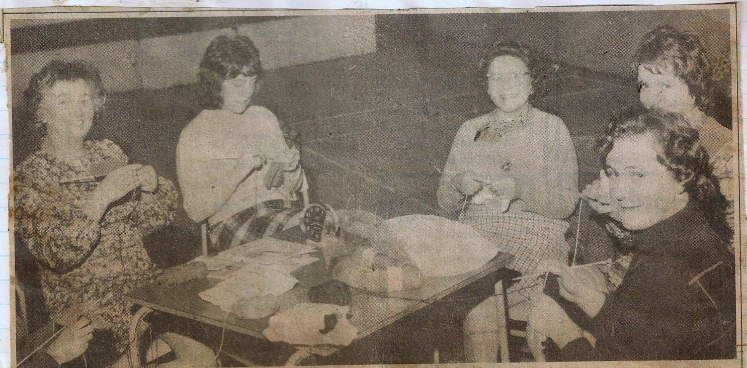
The steady click of needles signified the start of this knitting marathon staged by Bridge Young Wives in the village hall on Wednesday in aid of Highland Court Hospital. More pictures on page 4.

Thank you every one for making such generous donations. It is so heartening to know that you care for others less fortunate than yourselves. May God bless you all.