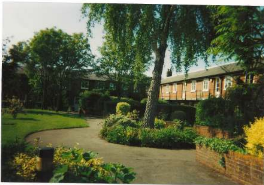
18/3 Bridge Literature Group 'Excellent treated historic buildings'