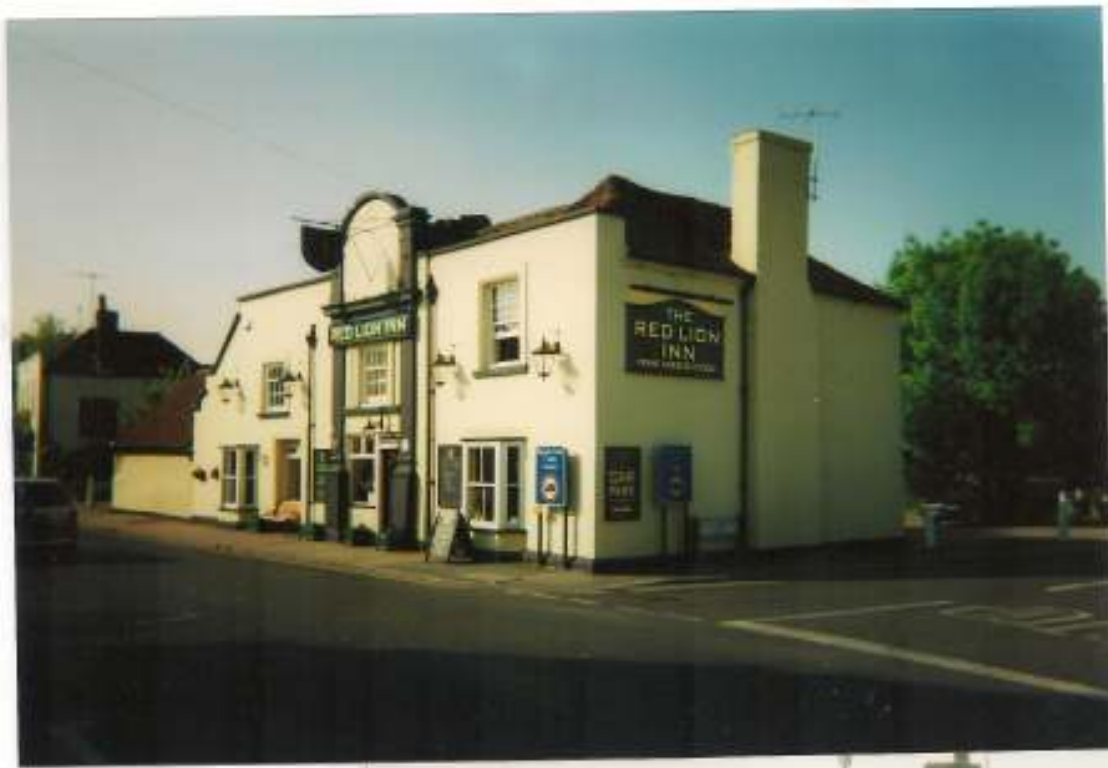
18/6 Literature Group 'Characterful old Building'