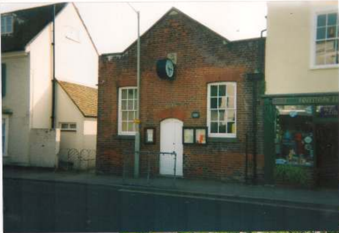
11/6 Allamant Association