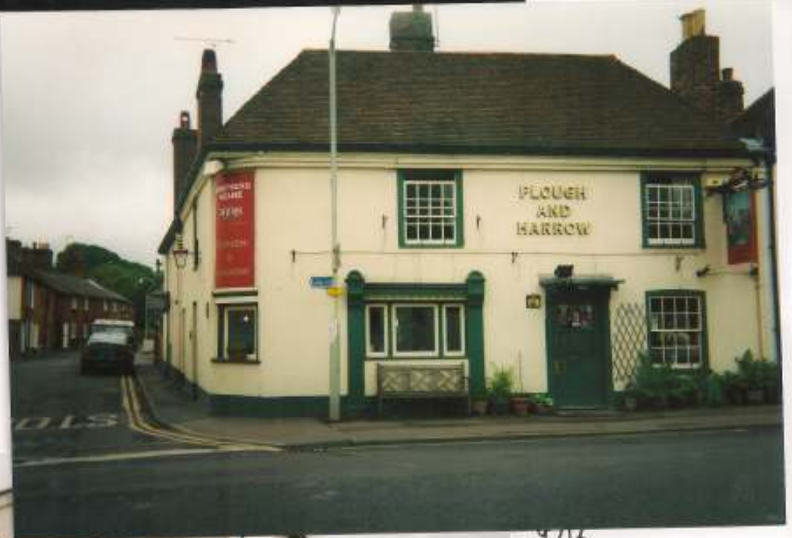
10/8 church 'The Pub is the Hub - particularly this one'