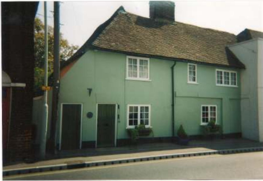
1/19 Bridge History Society 'Another well looked after cottage - perhaps the oldest in the village'