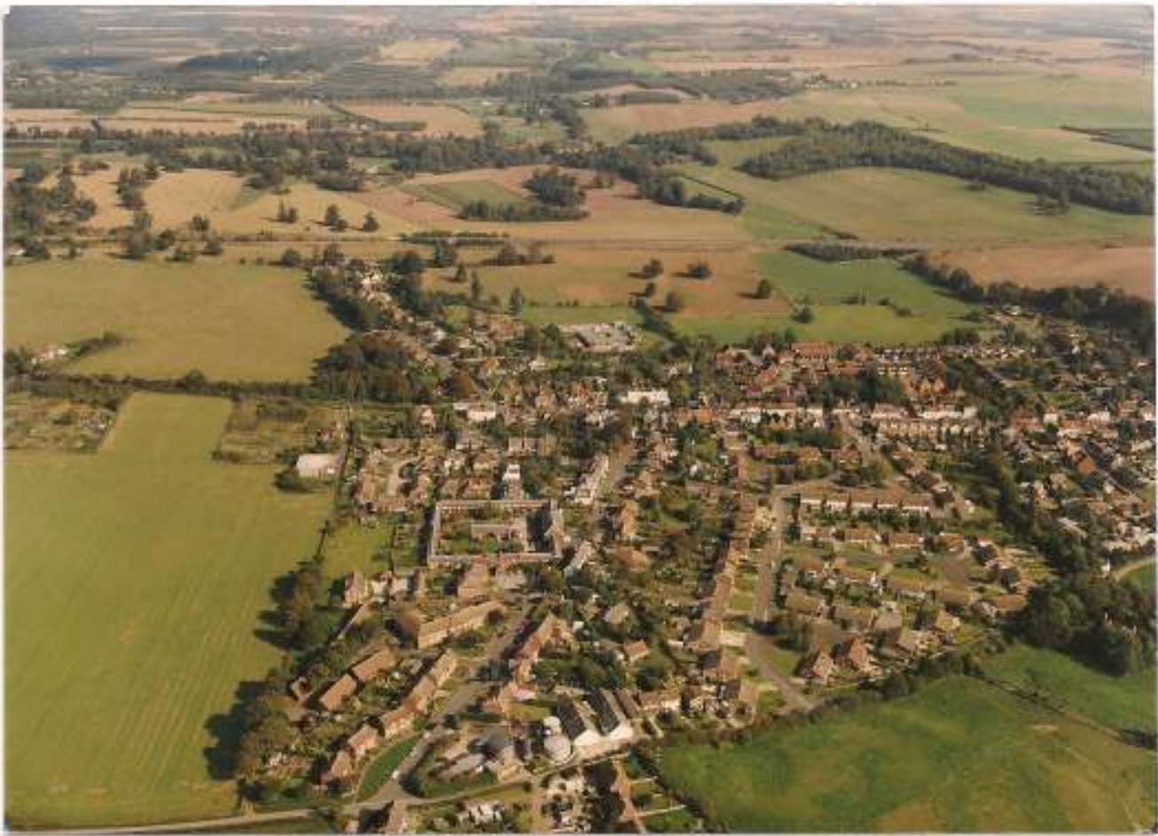
4076/42 The Franklin Fuller Partnership