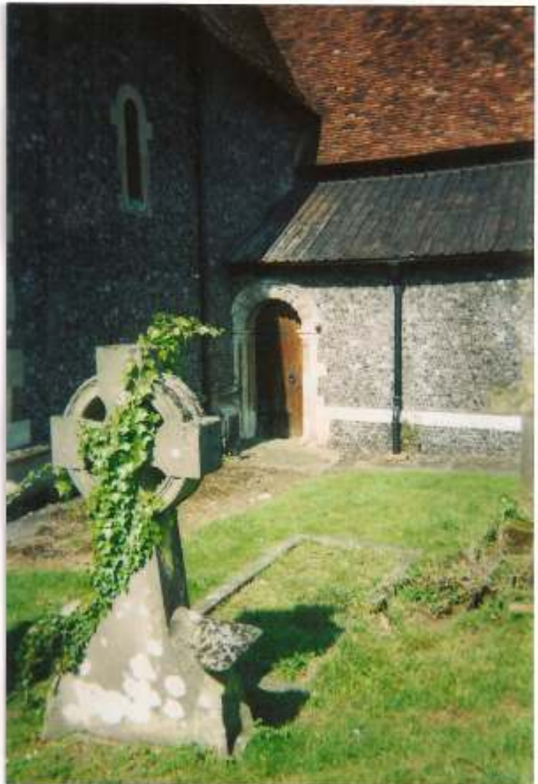
1/13 Bridge History Society