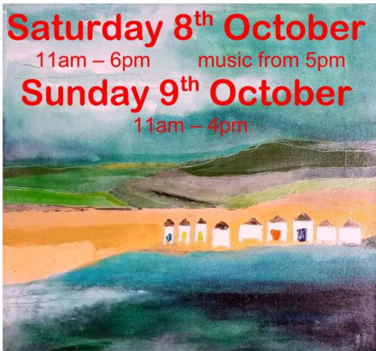
End of the Row – Heather Defferary 2015

Bridge Village Hall, High Street, Bridge