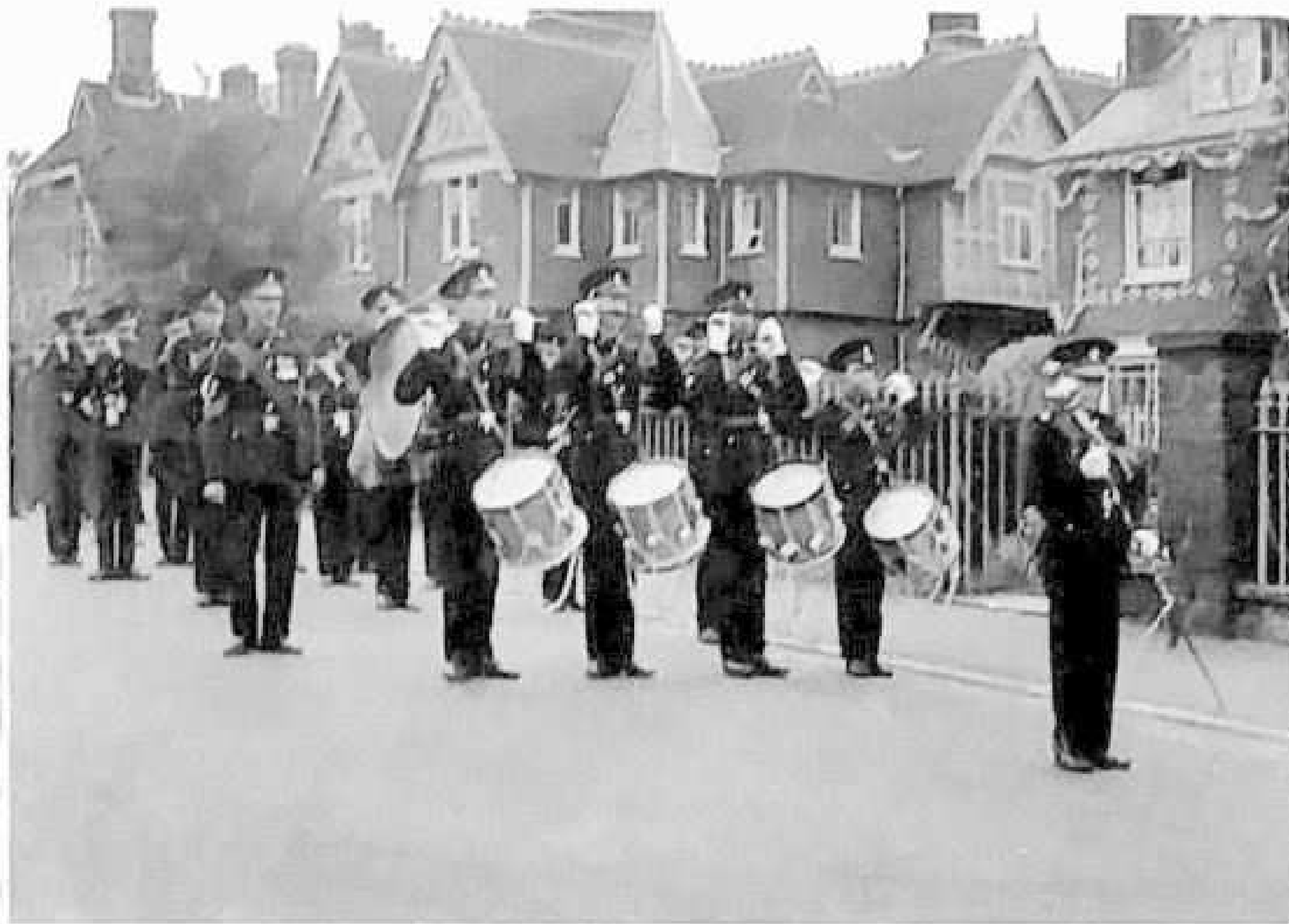
Bridge May 1935