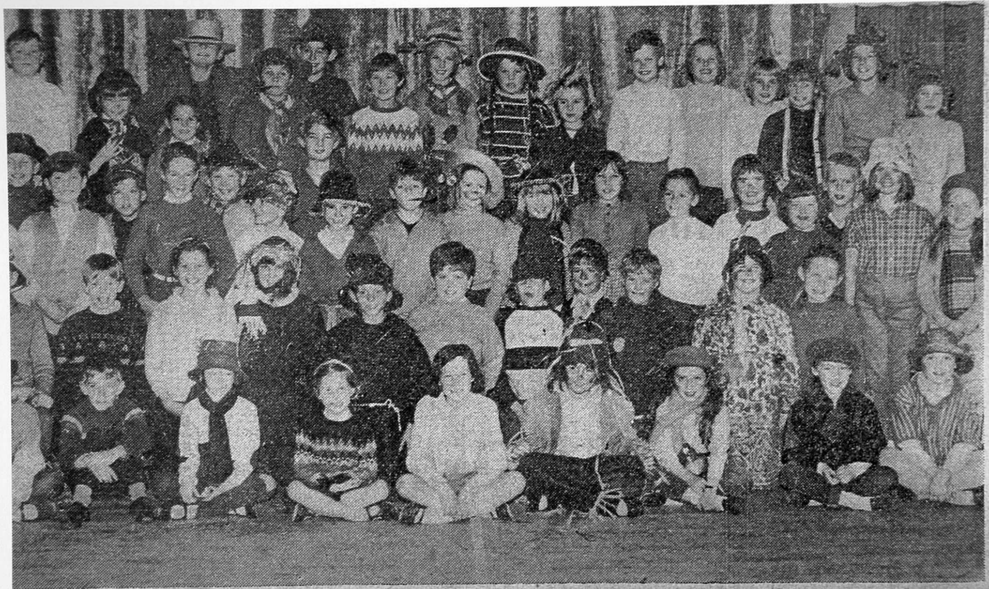
idge Brownies were hosts to the 5th Canterbury (Bridge) Cub Scout Pack at a scarecrow party held in the Village Hall on Saturday, to celebrate their fourth birthday.