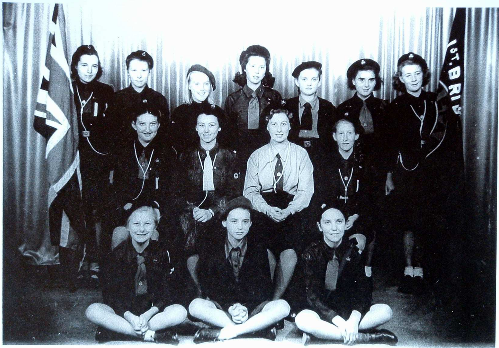
1st Bridge Guide Company 1950