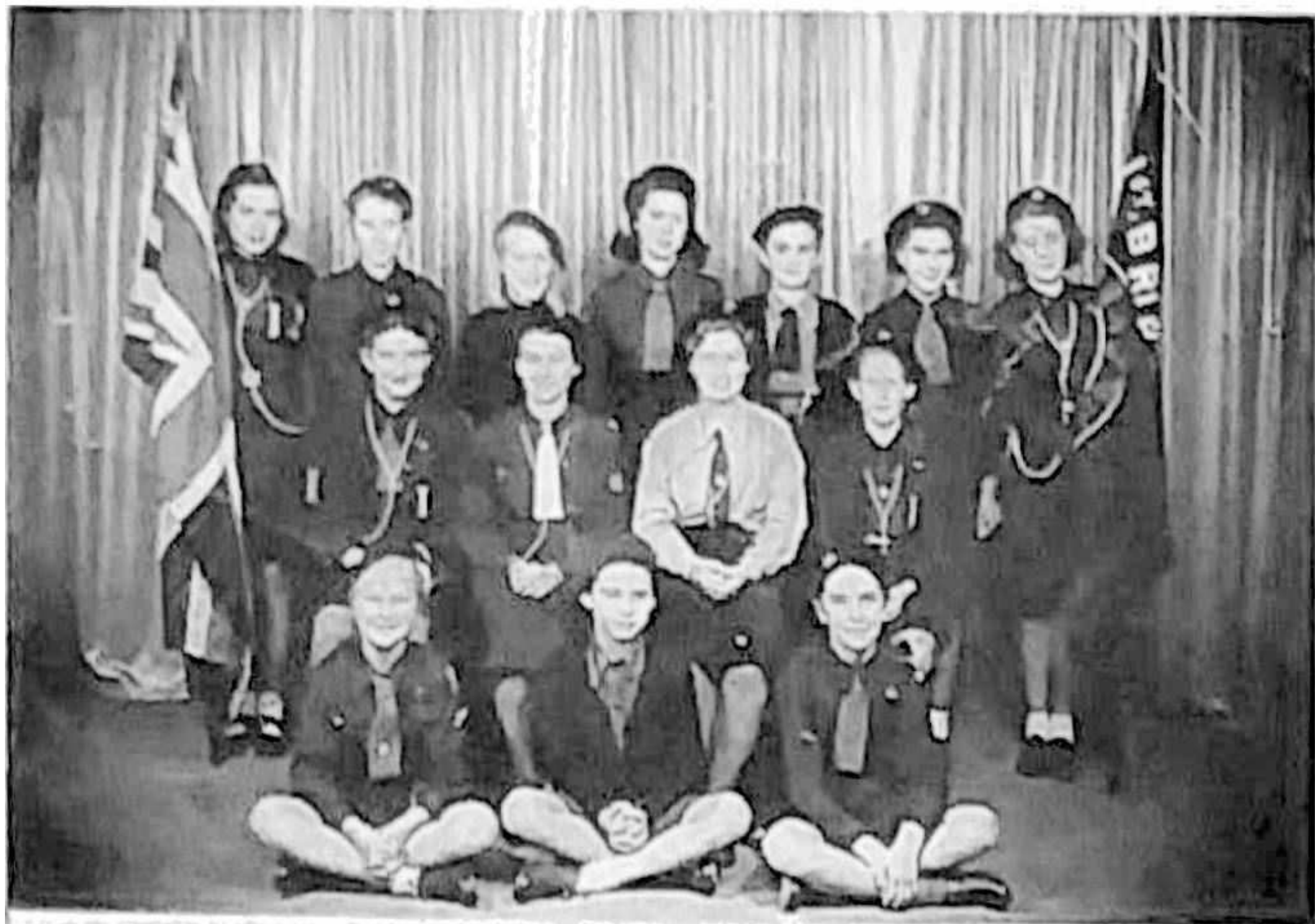
Bridge Girl Guides