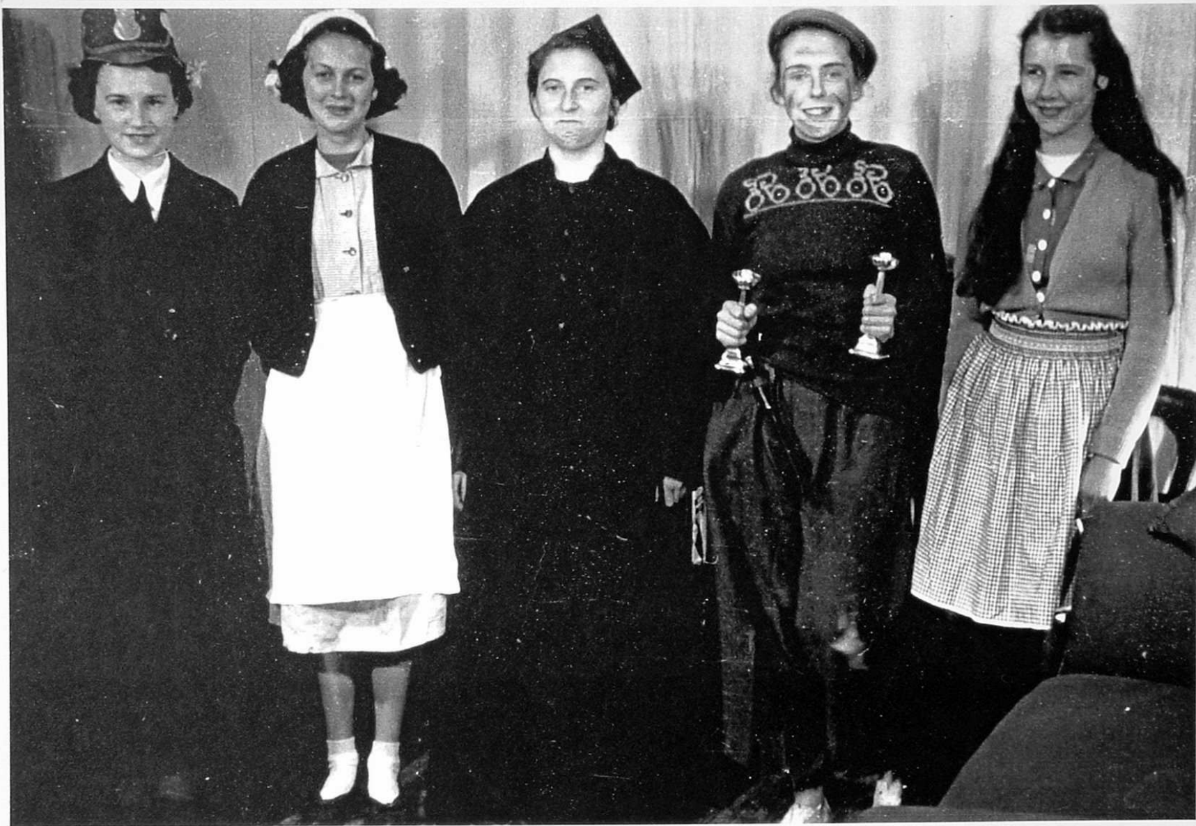
"The Bishops Candlesticks" 1952