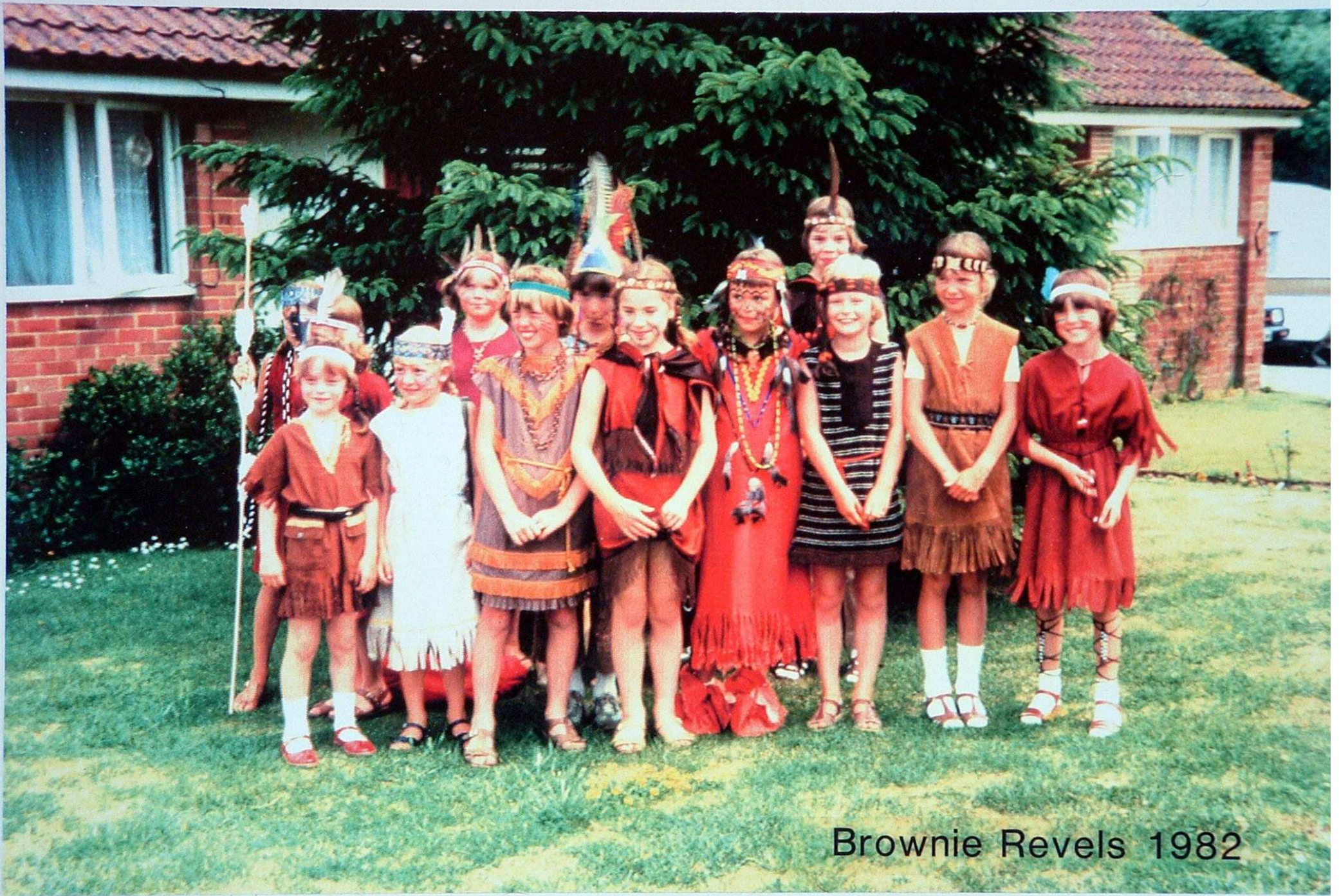
Brownie Revels 1982