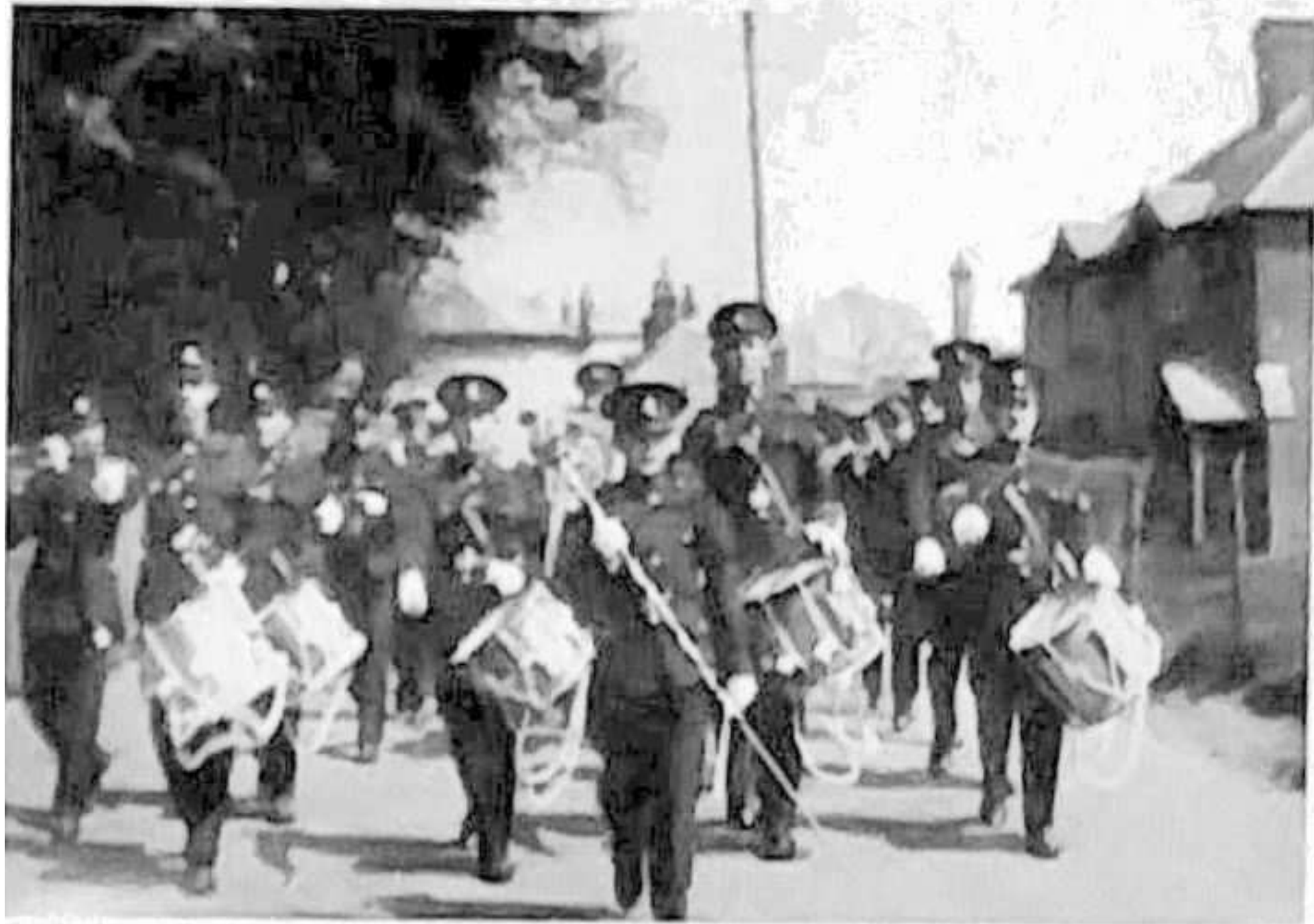
Boys Brigade band - 1935