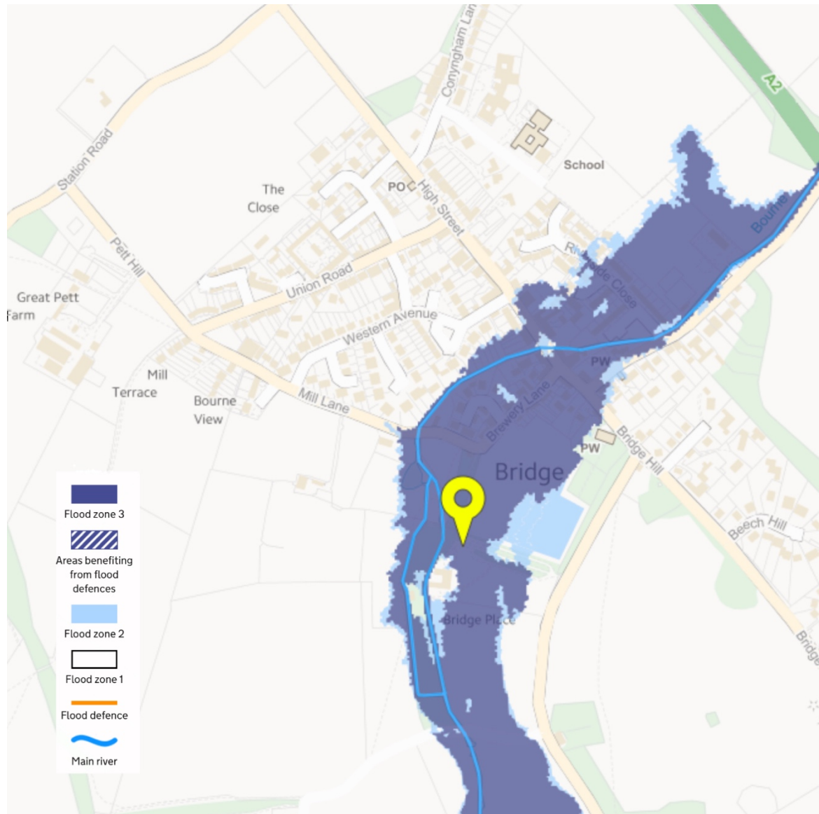
Environment Agency Flood Risk Map for the Village of Bridge May 2018