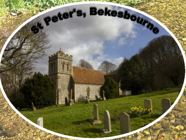
St Peter's, Bekesbourne