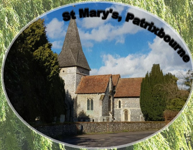
St Mary's, Patrixbourne

A magazine for the villages along the Nailbourne