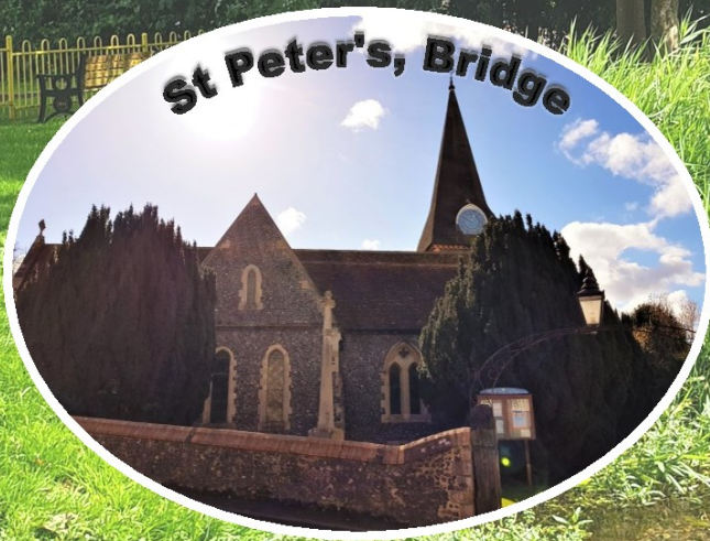
St Peter's, Bridge