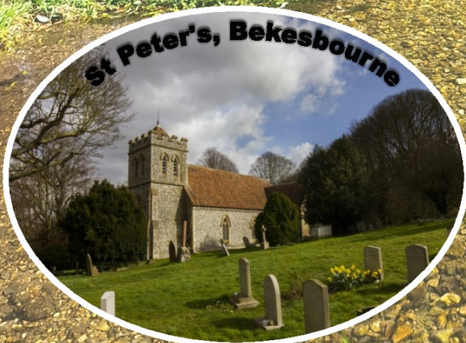
St Peter's, Bekesbourne