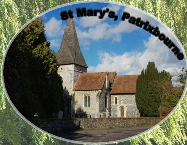
St Mary's, Patrixbourne

A magazine for the villages along the Nailbourne