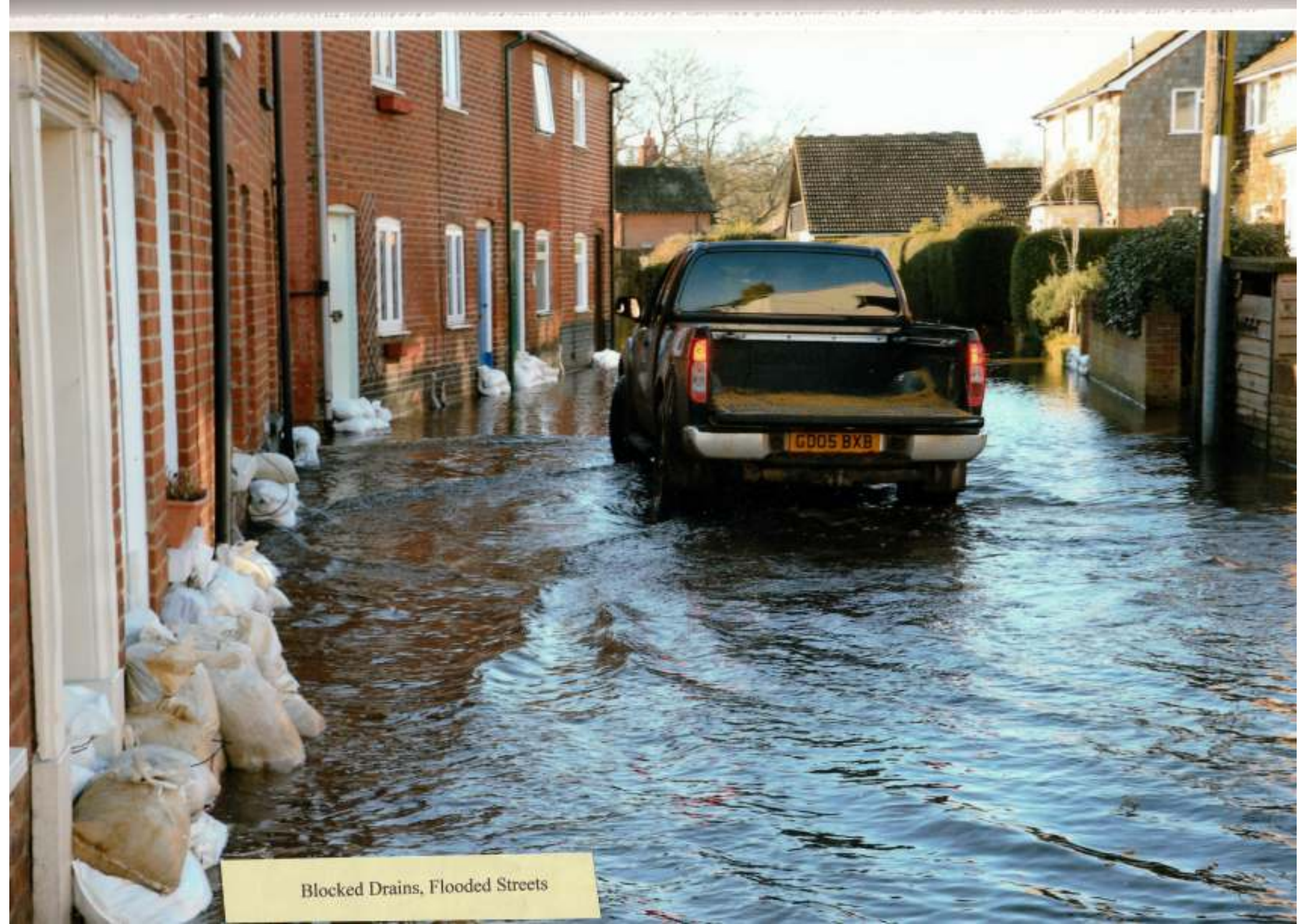
Blocked Drains, Flooded Streets