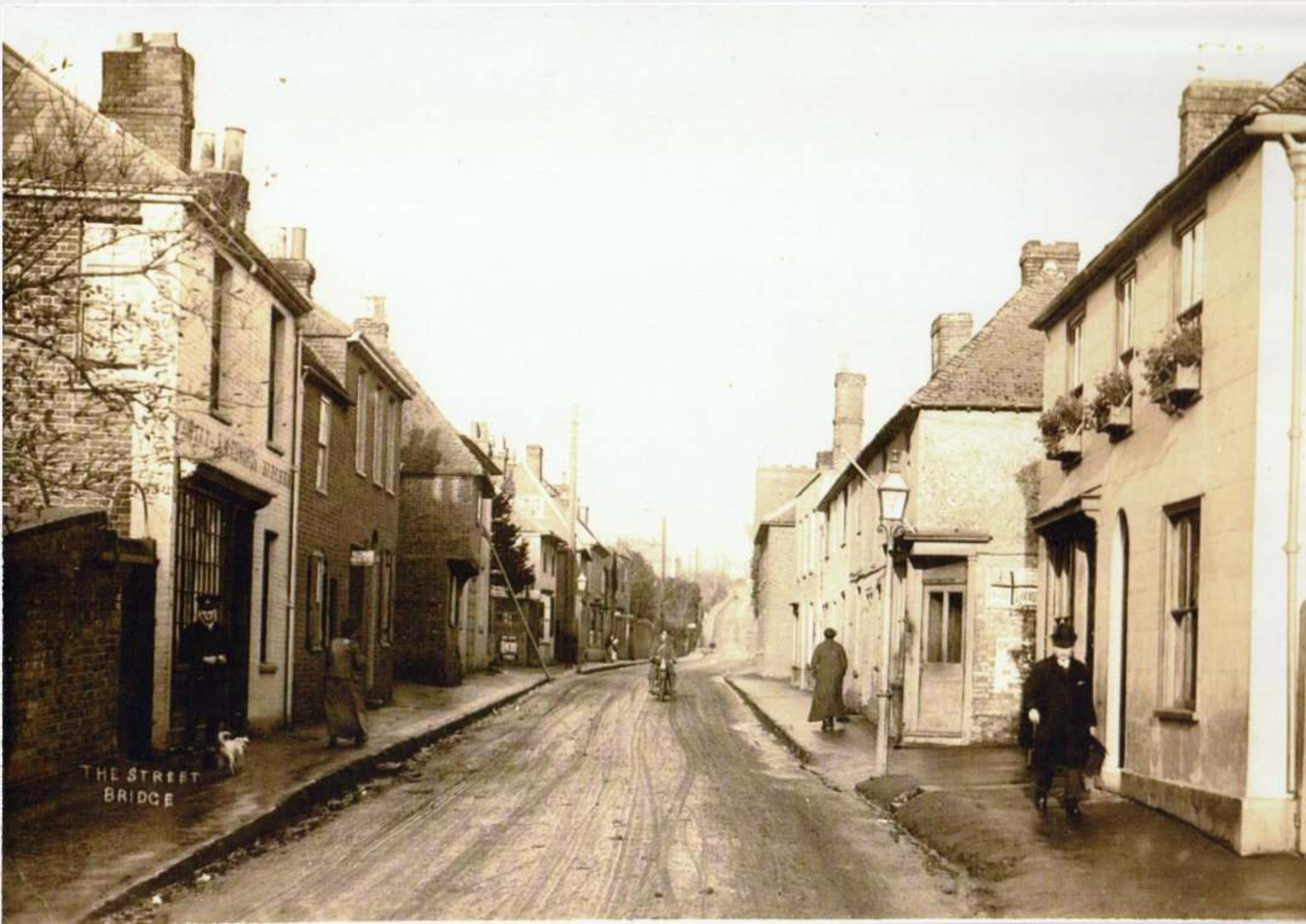
THE STREET BRIDGE