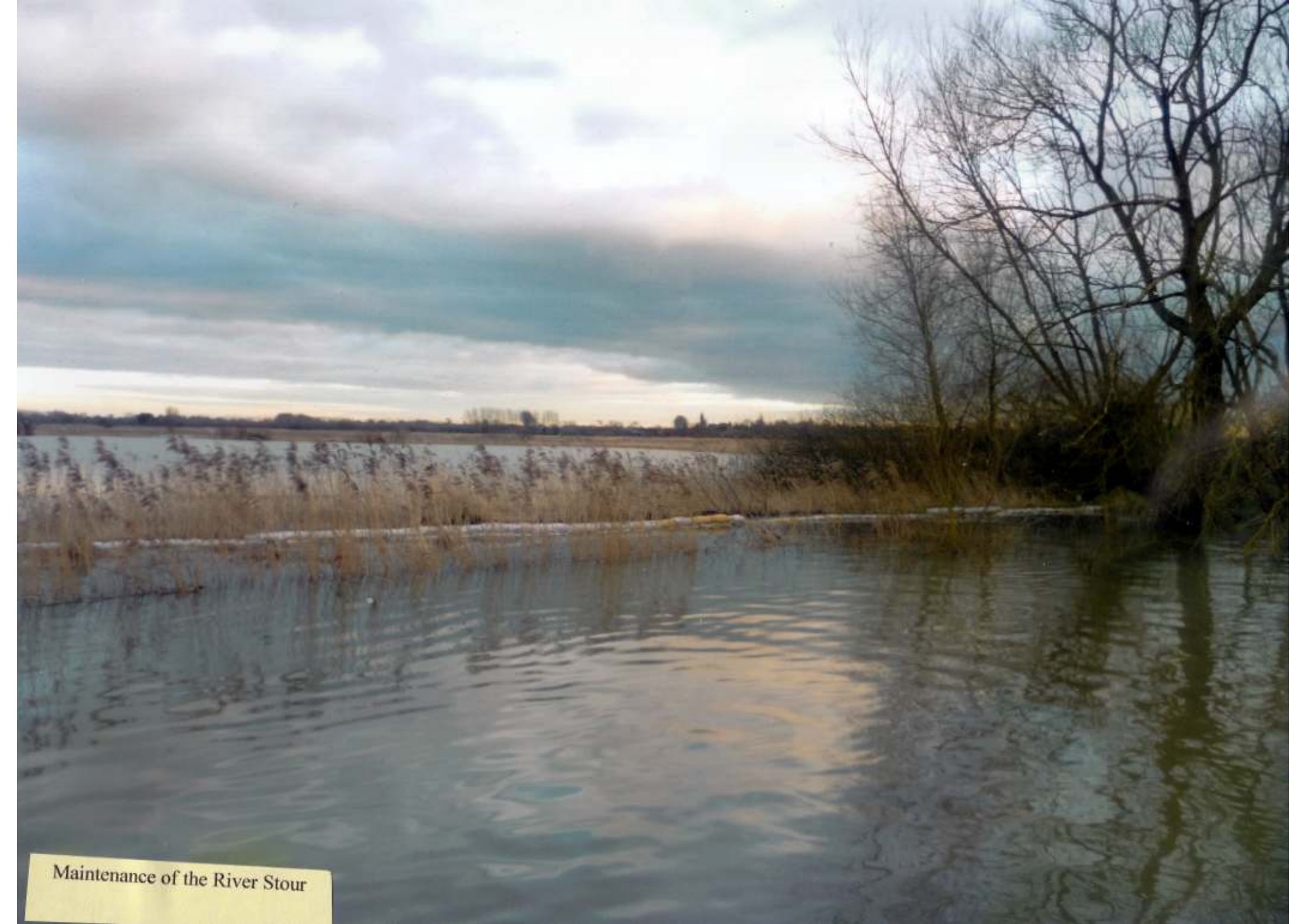
Maintenance of the River Stour