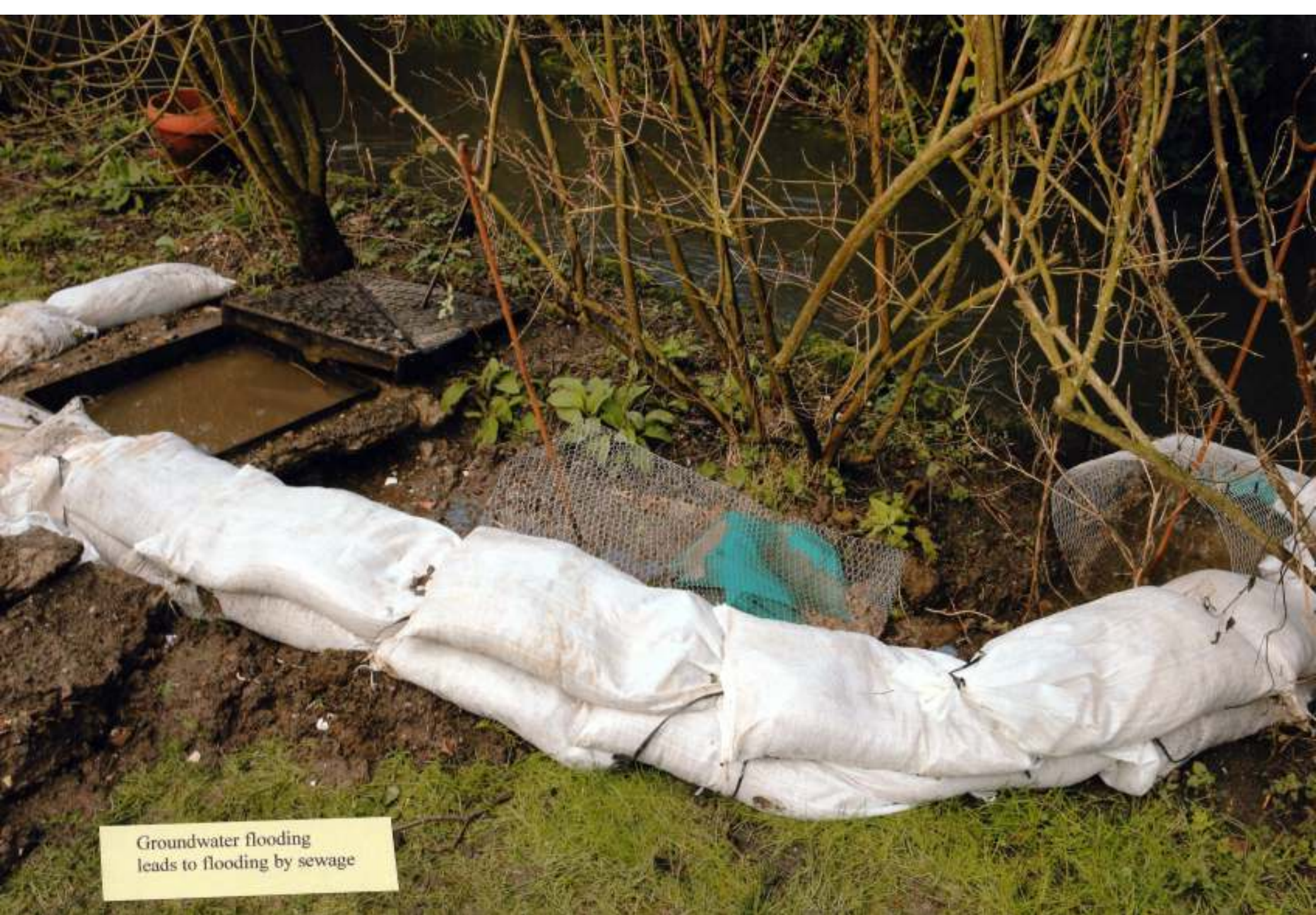
Groundwater flooding leads to flooding by sewage