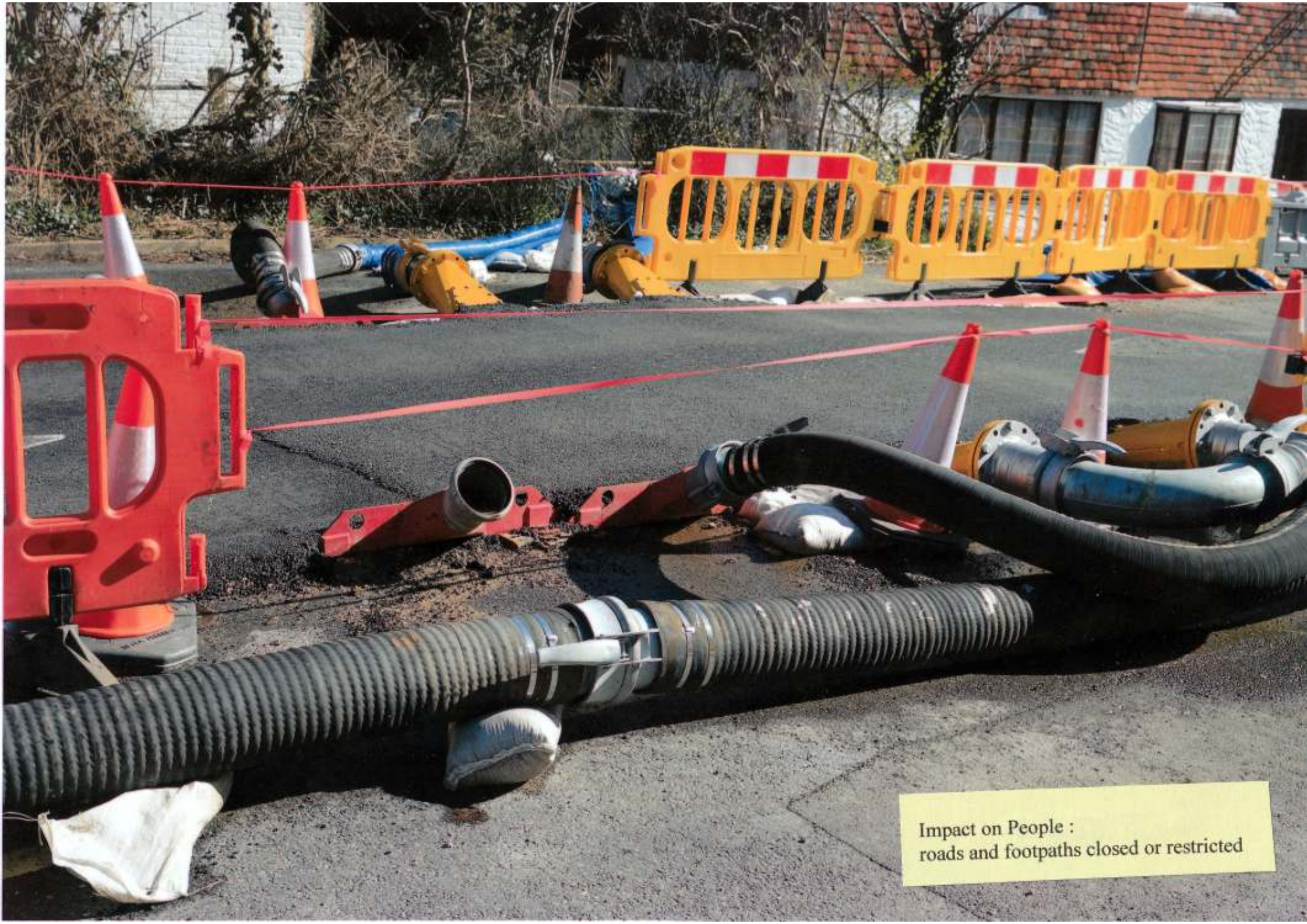
Impact on People : roads and footpaths closed or restricted