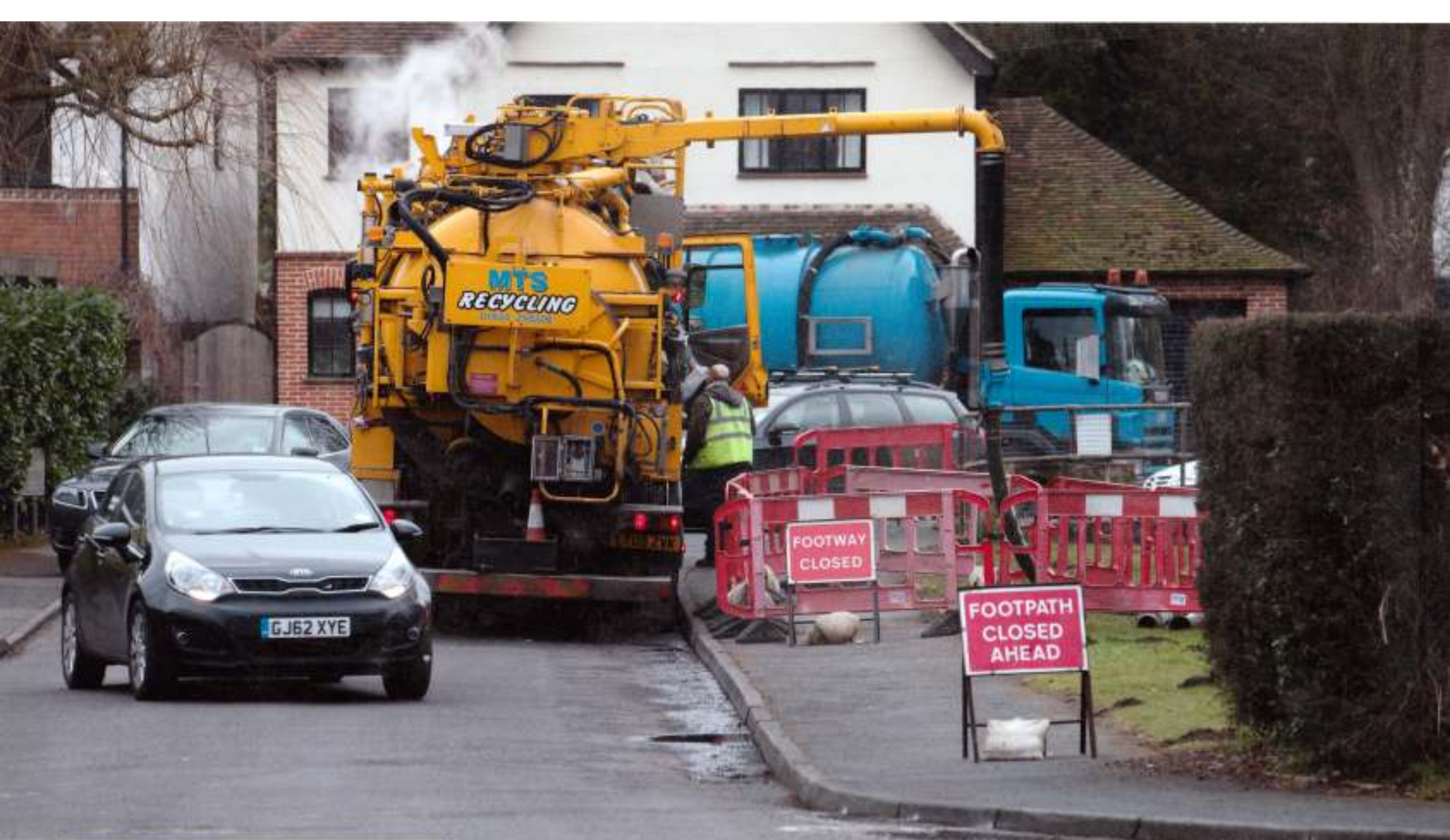
Impact on People : roads and footpaths closed or restricted