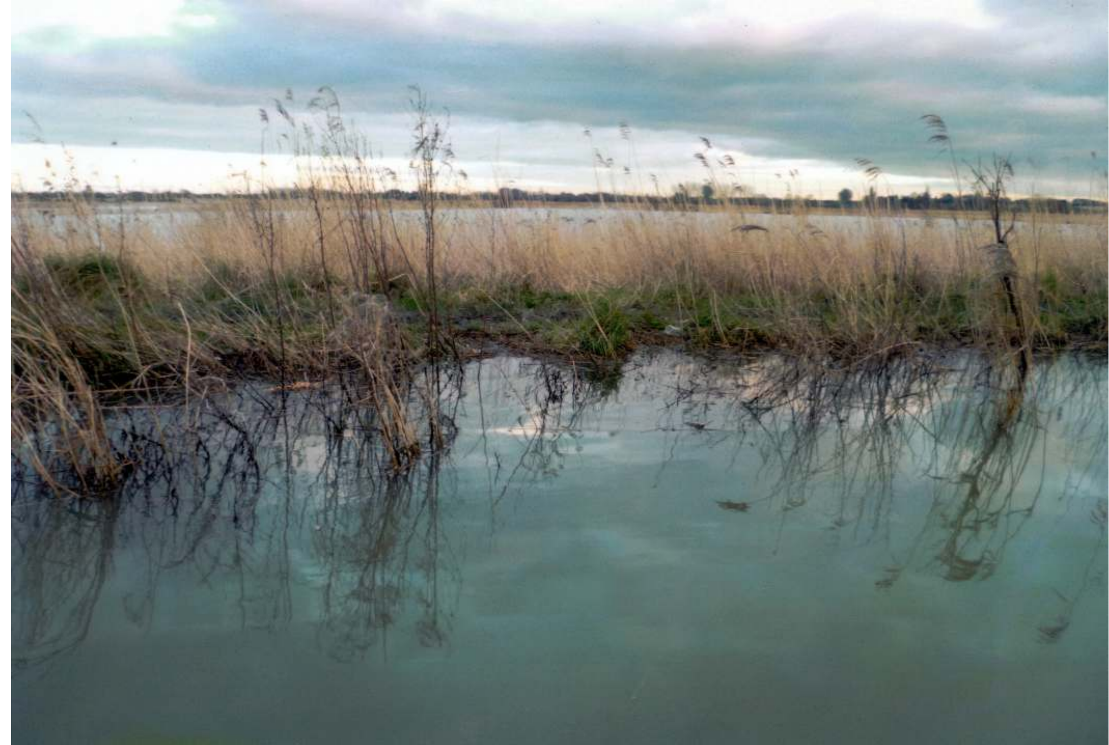
Maintenance of the River Stour