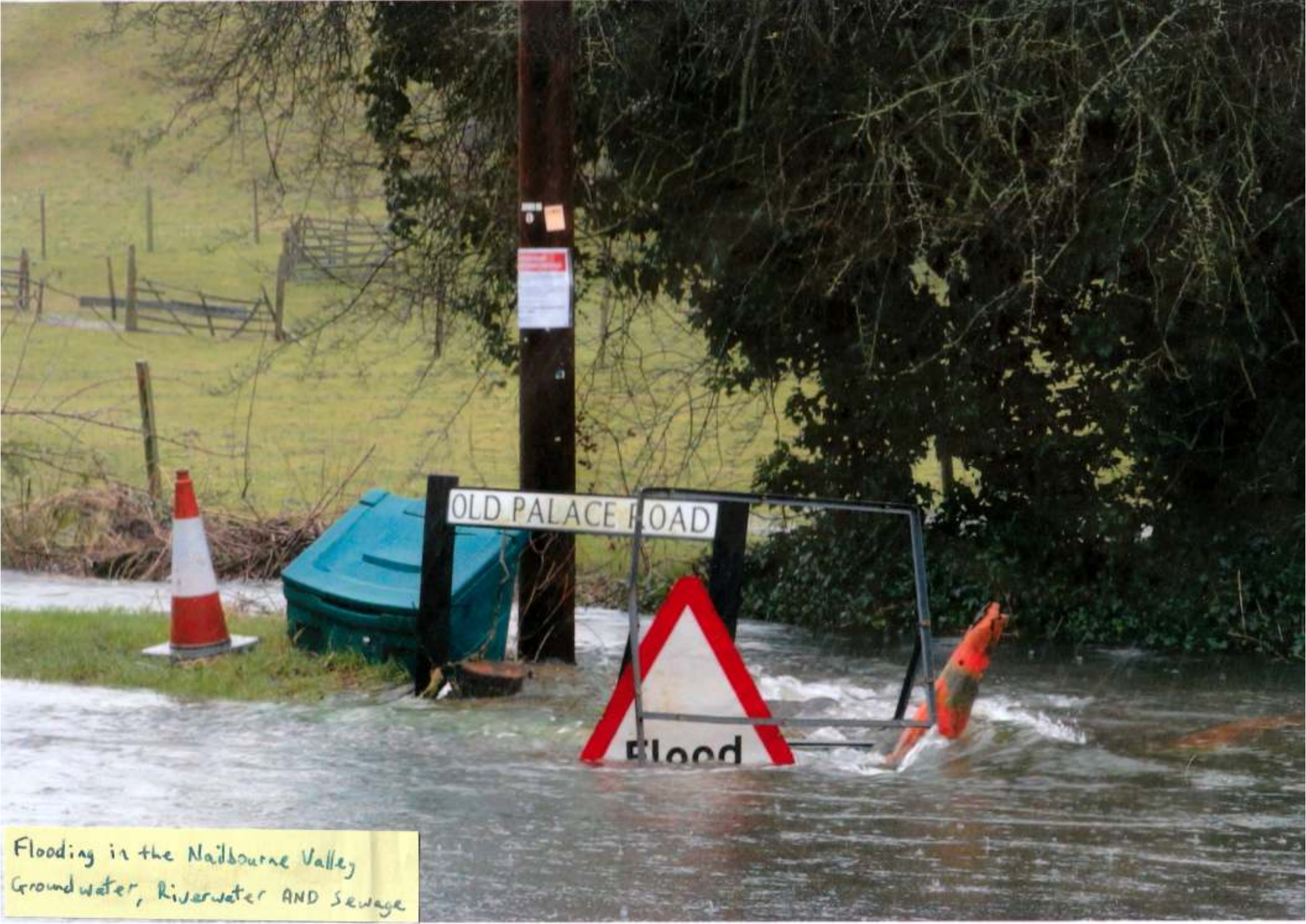
Flooding in the Nailbourne Valley Groundwater, Riverwater AND Sewage