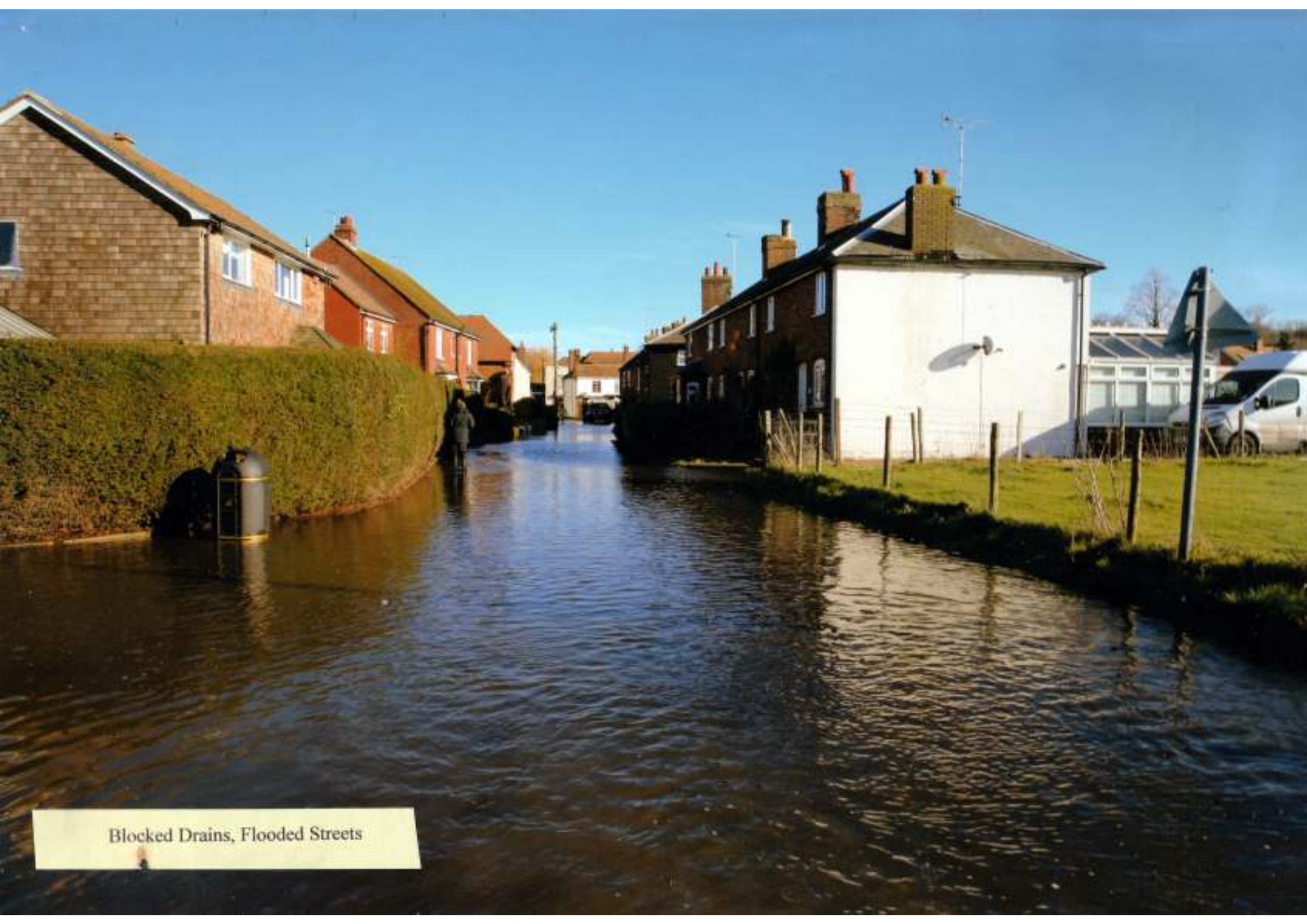
Blocked Drains, Flooded Streets