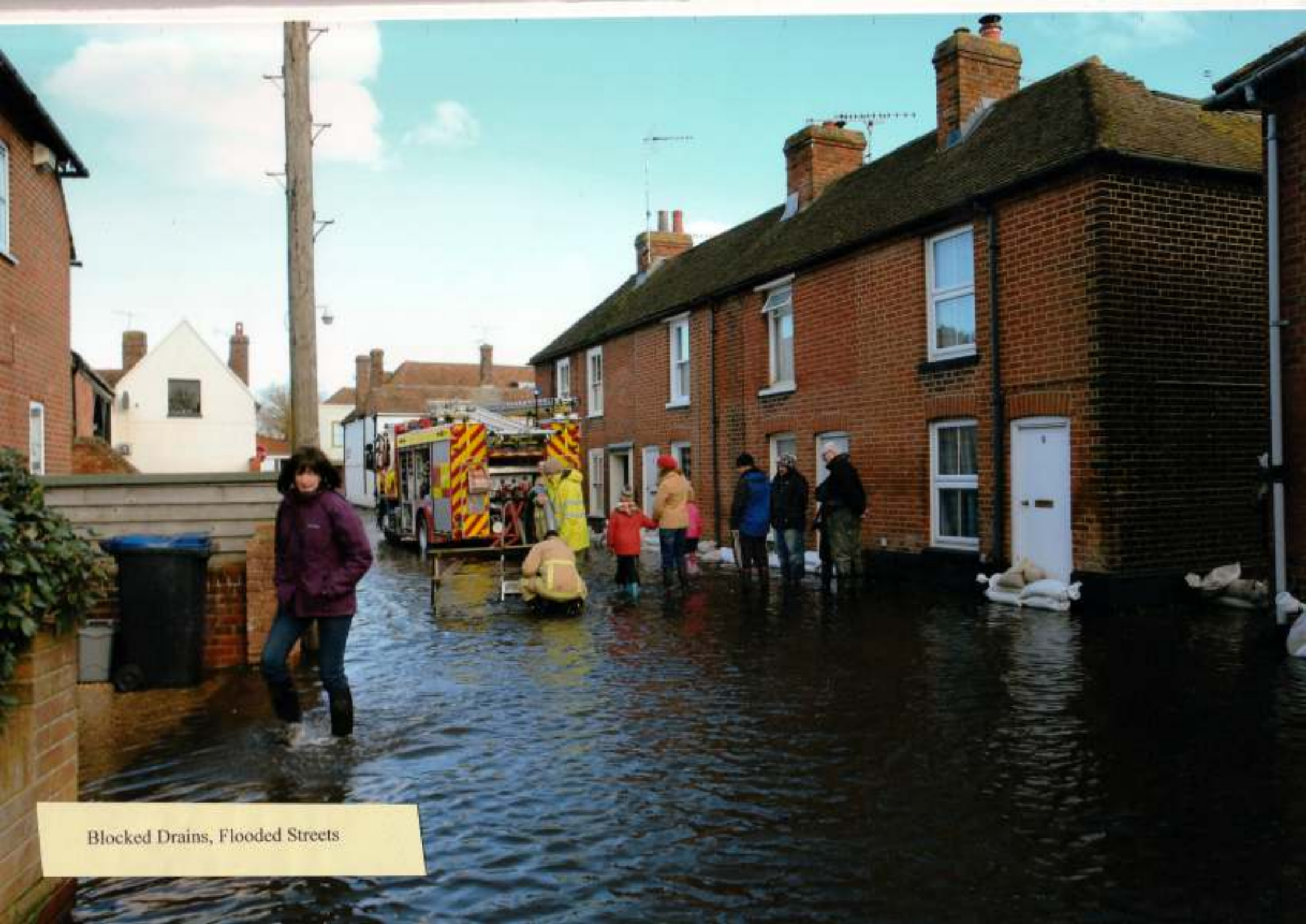
Blocked Drains, Flooded Streets