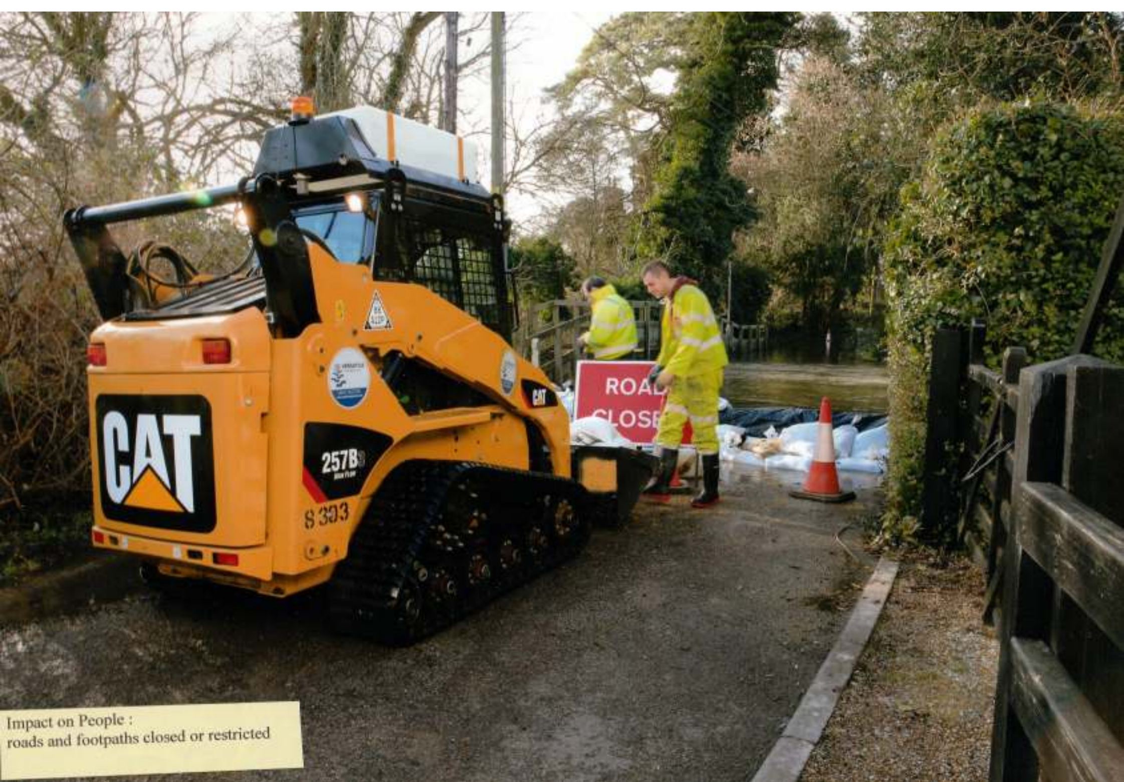
Impact on People : roads and footpaths closed or restricted