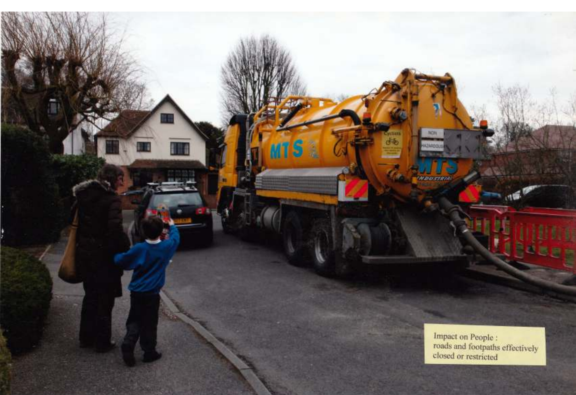
Impact on People : roads and footpaths effectively closed or restricted