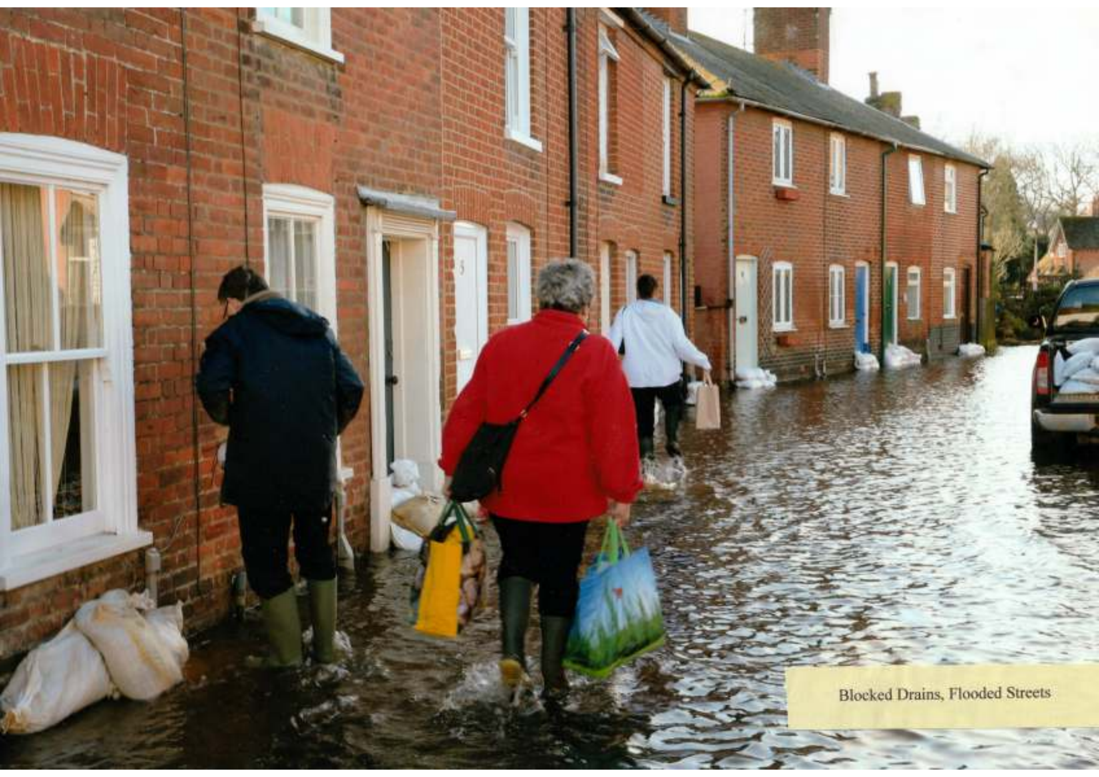
Blocked Drains, Flooded Streets