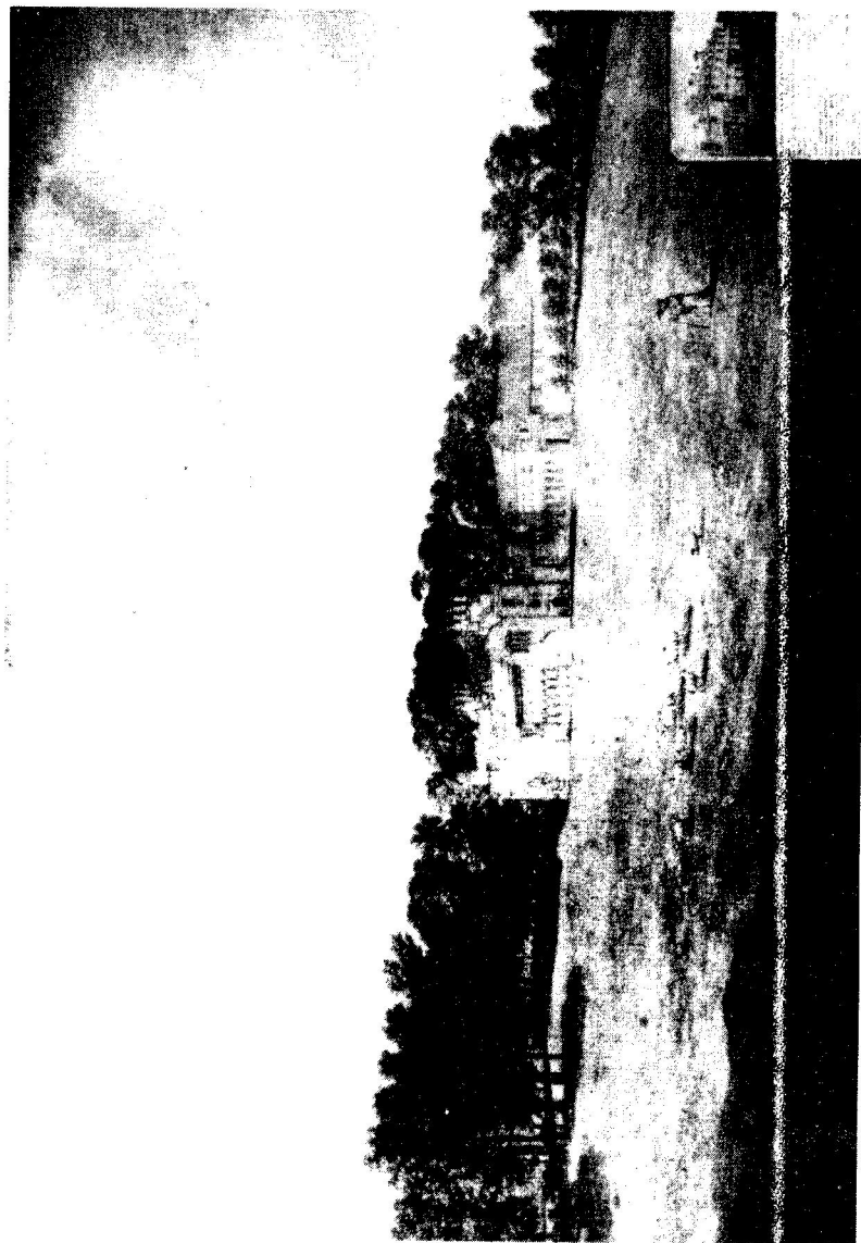
The south view: Showing the south of the house stripped of its formal garden.